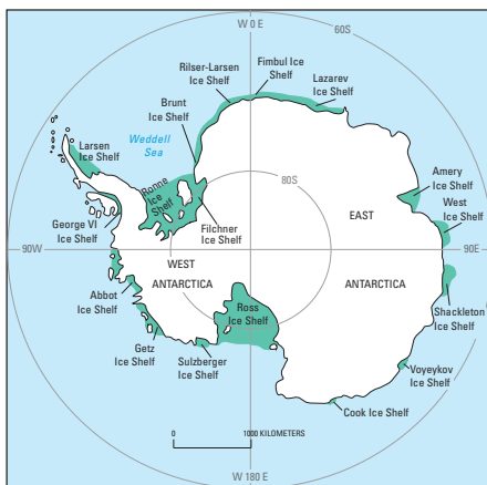
Figure 1. Index map to the principal geographic features of Antarctica, including the ice shelves where large coastal-change events commonly occur.

Ice fronts, iceberg tongues, and glacier tongues are the most dynamic and changeable features in the coastal regions of Antarctica. Floating ice margins are subject to frequent and large calving events or rapid flow. These situations lead to annual and decadal changes