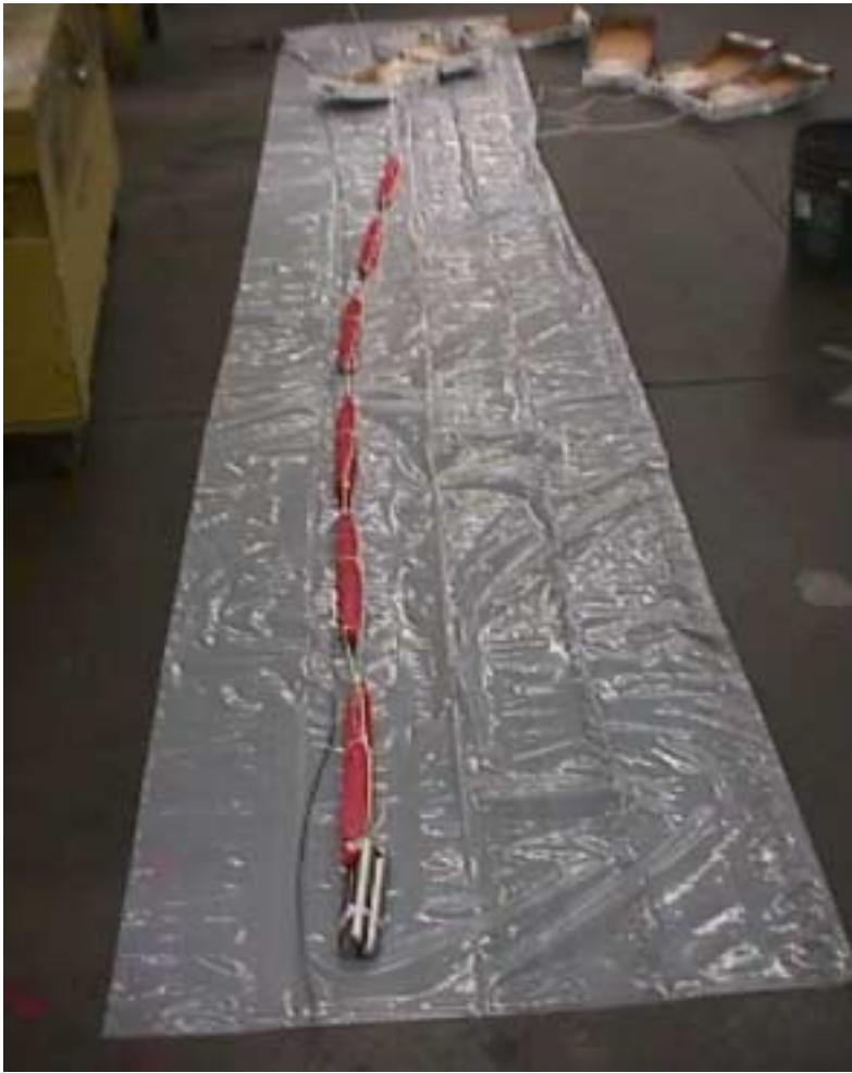
Figure 2. Example of multiple PDB samplers prepared for deployment.

(c) PDB samplers should not be used in wells having screened or open intervals longer than 10 ft unless used in conjunction with borehole flow meters or other techniques to characterize vertical variability in hydraulic conductivity and contaminant distribution or used strictly for qualitative reconnaissance purposes. This is because of the increased potential for cross contamination of water-bearing zones and hydraulically driven mixing effects that may cause the contaminant stratification in the well to differ from the contaminant stratification in the adjacent aquifer material. If it is necessary to sample such wells, then multiple PDB samplers should be installed vertically across the screened or open interval to determine the zone of highest concentration and whether contaminant stratification is present.