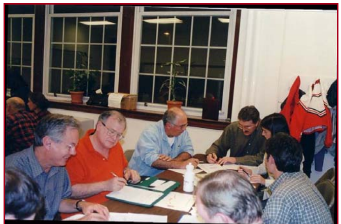
Under the guidance of C-SAW, members of the Conodoquinnet Creek Watershed Association learn how to interpret water-quality data.