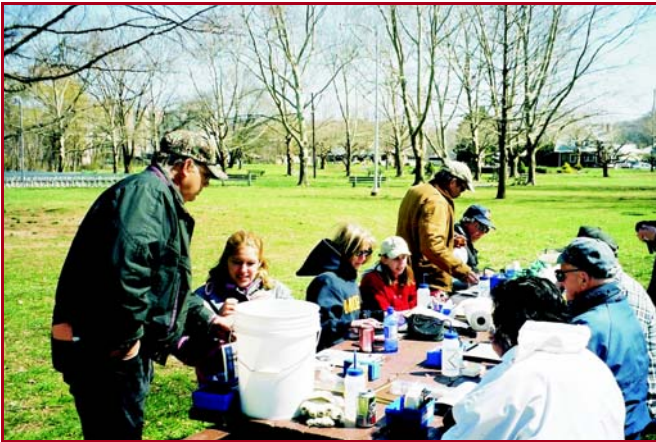
Mentoring assistance is available from C-SAW for a variety of watershed activities. Here, staff from the Delaware Riverkeeper Network train members of the Maiden Creek Watershed Association how to use field kits for water chemistry.

Selection of groups to be mentored will be based on group need, watershed issues, and application information provided by the watershed organization. Local watershed organizations interested in starting or improving volunteer monitoring programs for watershed assessments, assessing restoration projects, or developing protection plans will be considered first for receiving mentoring assistance. Because mentoring is the most time-intensive type of assistance offered by C-SAW, this process will be competitive and limited to a small number of watershed organizations in each river basin.