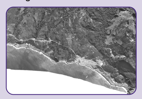
Lopez Point, Big Sur 1942