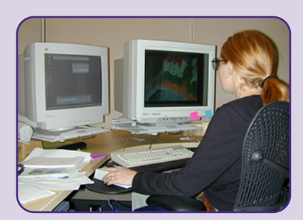
Processing and analyzing the digital files

More information on the web: http://walrus.wr.usgs.gov/posters