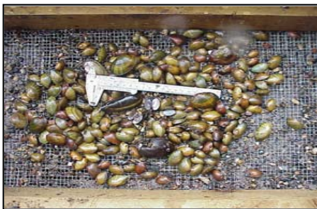
Results from host fish cages in CY 2002 Many juvenile mussels are found including Higgins eye

The Fisheries Program is using propagation as a tool to increase juvenile recruitment and survival, until populations can sustain themselves.