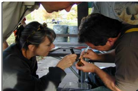
Biologists harvesting mussel larvae to place on host fish. They will live on the hosts gills for 3-6 weeks before dropping to the riverbed. Host fish are held in cages over suitable river habitat until mussels are released.

The Fisheries Program is using propagation as a tool to increase juvenile recruitment and survival, until populations can sustain themselves.