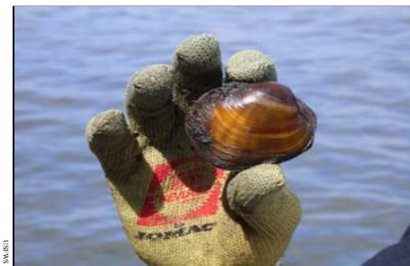
The Adult Higgins Eye, after being cleaned of zebra mussels. Zebra mussels use freshwater mussels to attach to, causing the mussels to suffocate or slowly starve to death..

Siltation from poor land use practices, zebra mussel infestation, and pollution has caused mussels to decline drastically. Over 250,000 juvenile mussels produced at Genoa in 2002 were stocked at three different recovery sites. Many juveniles stocked previously are now being found in spring assessments.