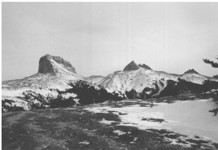
Fig. 3. Snow accumulates in the tree islands and fingers and their immediate lee, but is blown clear on the tundra so that the total precipitation available for plant growth is spatially limited; Lee Ridge, Glacier National Park, Montana.