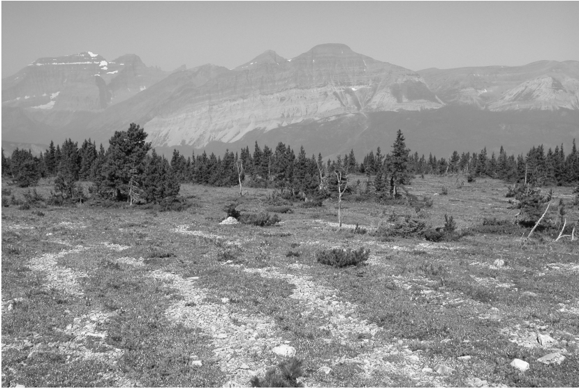
Fig. 2. Trees establish in tree islands or fingers in sparse tundra on the relict solifluction lobes of Lee Ridge, Glacier National Park, Montana.

pits dug in and near the high elevation krummholz (Ginger Schmid, Ph.D. candidate, Department of Geography, Texas State University, pers. comm., March 1, 2003). Soil under the tree and krummholz canopies often consisted of an indurated layer of duff. Other landscape disturbance factors that may preclude upslope movement of treeline, such as snow avalanche and debris flows, are not evident.