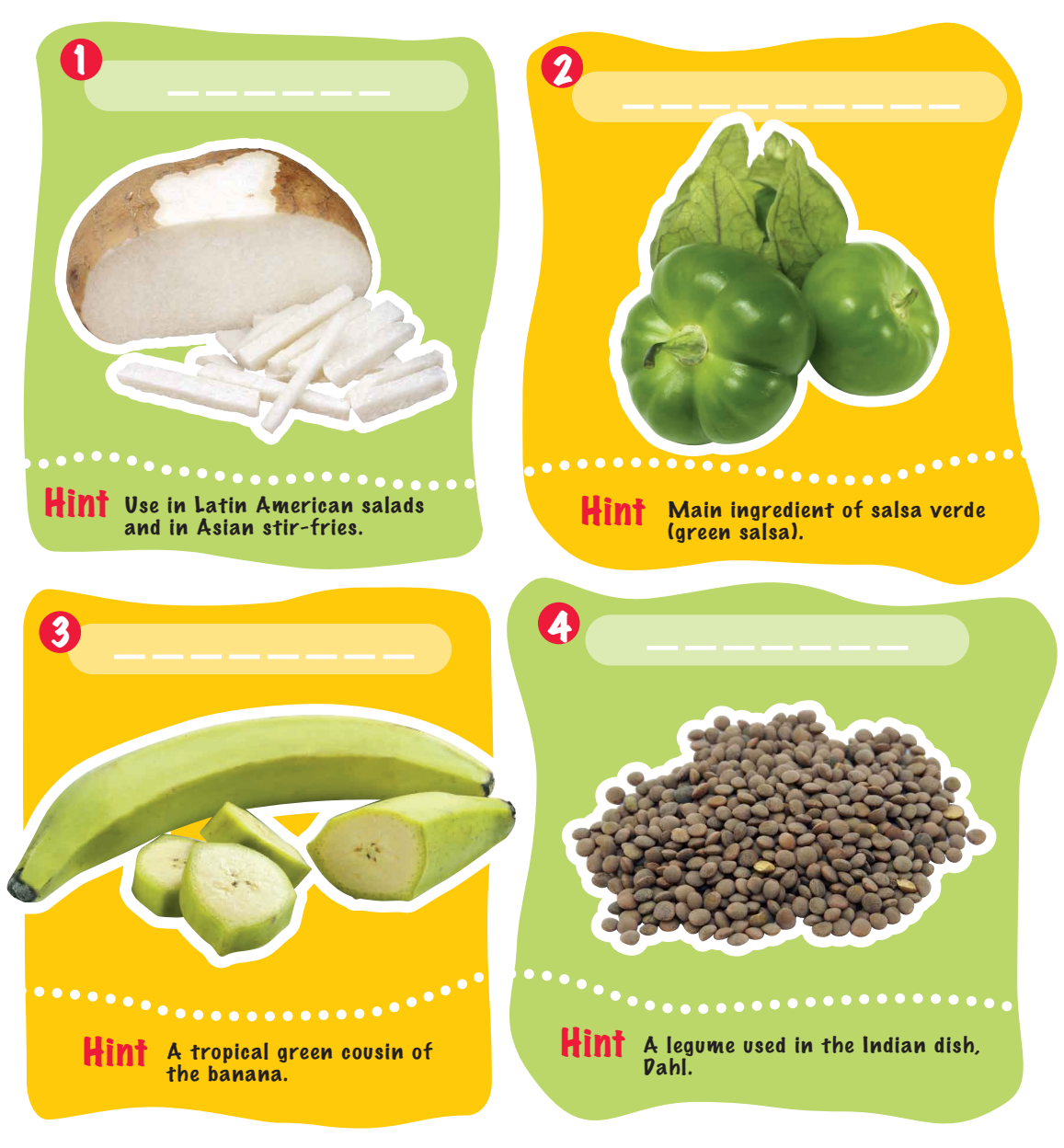
ANSWERS: 1. Jicama 2. tomatillo 3. plantain 4. lentils

You may not know some of these fruits and vegetables, but people around the world eat them every day. No need to travel far. Many are at your local grocery store. Give them a try.