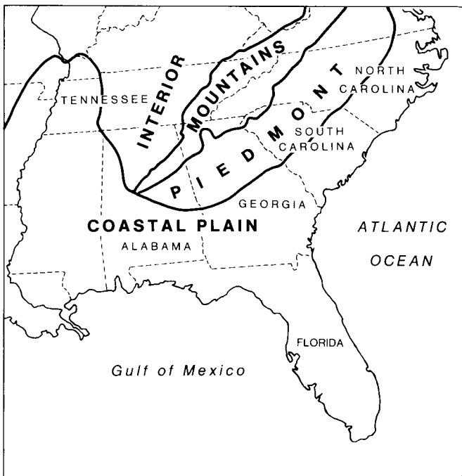
Figure. Major physiographic regions of the southeastern United States.

b References: (1) Bode 1983; (2) Boesel and Winner 1980; (3) Caldwell 1984; (4) Caldwell 1985; (5) Caldwell 1986; (6) Coffman et al. 1986; (7) Coffman and Roback 1984; (8) Cranston and Oliver 1988a; (9) Cranston et al. 1983; (10) Cranston and Saether 1986; (11) Ferrington 1984; (12) Ferrington and Saether 1987; (13) Halvorsen 1982; (14) Halvorsen and Saether 1987; (15) LeSage and Harrison 1980; (16) Oliver 1981; (17) Oliver 1985; (18) Oliver and Bode 1985; (19) Oliver and Roussel 1983; (20) Rempel 1937; (21) Saether 1969; (22) Saether 1975a; (23) Saether 1976; (24) Saether 1977b; (25) Saether 1981a; (26) Saether 1981b; (27) Saether 1982; (28) Saether 1983a; (29) Saether 1984; (30) Saether 1985a; (31) Saether 1985b; (32) Saether 1985c; (33) Saether 1985d; (34) Saether 1985f; (35) Saether 1985h; (36) Saether 1989; (37) Saether 1990; (38) Saether and Halvorsen 1981; (39) Saether and Sublette 1983; (40) Sponis 1977; (41) Sponis 1979; (42) Wirth 1952.