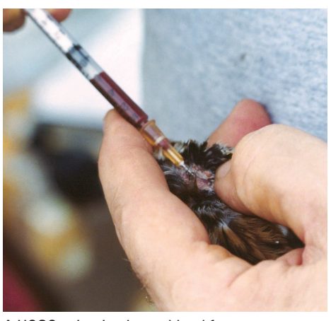
A USGS scientist draws blood from a sparrow.

The third study looks at five non-native and one native Hawaiian bird species to determine their susceptibility to the virus, as well as testing the natural transmissibility of the virus. Of particular interest is the native golden plover, which occasionally migrates to Hawaii from the continental U.S, and could potentially