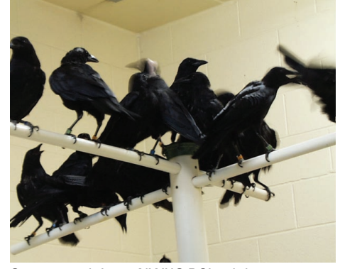
Crows perch in an NWHC BSL-3 laboratory

Much work has been done to understand the public health effects of this disease since its arrival in New York City.