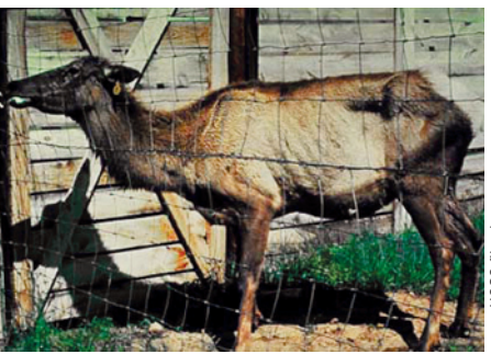
A captive elk with chronic wasting disease

The USGS National Wildlife Health Center (NWHC) conducted a workshop in late 2002 to develop strategies for detecting and monitoring CWD in wild deer and elk. Participants from diverse backgrounds, such as cervid population biology, wildlife disease management, and statistical modeling, provided