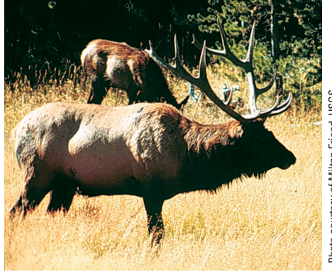
A healthy elk

In response to the discovery of CWD in new and unexpected areas, U.S. Geological Survey (USGS) scientists began collaborating with federal, state, and private partners to address the challenges of this disease. Critical needs included establishing new diagnostic capabilities, analyzing, modeling, and predicting the disease's effects, all while coordinating and distributing reliable information from a variety of resources. However, more knowledge about this disease is needed.