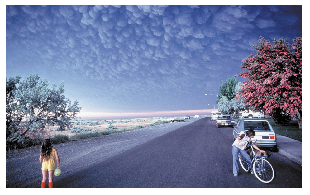
This surreal-looking photo shows an enormous cloud of volcanic ash approaching the small town of Ephrata, Washington, on the morning of May 18, 1980. The ominous cloud was from Mount St. Helens, 145 miles to the west. The volcano had begun to erupt explosively less than 3 hours earlier, catching many communities downwind unprepared for the destructive rain of gritty ash that followed.

and roads were quickly covered by as much as 4 inches of gritty ash. The smallest ash particles penetrated machinery and all but the most tightly sealed structures. By the end of the day, more than 500 million tons of ash had fallen onto parts of Washington, Idaho, and Montana. The ash prevented travel throughout much of eastern Washington because of poor visibility, slippery roads, and ash-damaged vehicles, stranding more than 10,000 people and isolating many small communities.