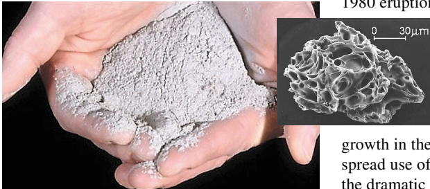
Volcanic ash, like this 1980 ash from Mount St. Helens, Washington, is made up of tiny jagged particles of rock and glass (see inset; magnified 200 times). Long and severe exposure to such ash particles, without protective breathing equipment, can be dangerous and harmful. For people with heart and lung ailments, inhaling ash can cause serious respiratory problems.

As the clouds drifted overhead, a rain of ash began to fall, plunging much of the region into darkness that lasted all day. Homes, farms,