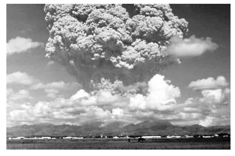
A huge cloud of volcanic ash and gas rises above Mount Pinatubo, Philippines, on June 12, 1991. Three days later, the volcano exploded in the second-largest volcanic eruption on Earth in this century. Timely forecasts of this eruption by scientists from the Philippine Institute of Volcanology and Seismology and the U.S. Geological Survey enabled people living near the volcano to evacuate to safer distances, saving at least 5,000 lives.

On July 16, 1990, a magnitude 7.8 earth-quake (comparable in size to the great 1906 San Francisco, California, earthquake) struck about 60 miles (100 kilometers) northeast of Mount Pinatubo on the island of Luzon in the Philippines, shaking and squeezing the Earth's crust beneath the volcano. At Mount Pinatubo, this major earthquake caused a landslide, some local earthquakes, and a short-lived increase in steam emissions from a preexisting geothermal area, but otherwise the volcano seemed to be continuing its 500-year-old slumber un-