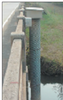
Typical flood-monitoring gage composed of a water stilling well and a gage house that shelters stage-recording equipment atop the stilling well. Gages are normally mounted to bridges where the river stage data are transmitted to the Georgia District Office in Atlanta.

The U.S. Geological Survey (USGS), in cooperation with other Federal, State, and local agencies, operates a Flood Monitoring System in the Flint River Basin. This system is a network of automated river stage stations (eleven are shown on the reverse side of this publication) that transmit stage data through satellite and telephone telemetry to the USGS Georgia District Office in Atlanta. During floods the public and emergency response agencies use this information to make decisions about road closures, evacuations, and other public safety issues. The emergency phone number for your area is listed under "Local flood emergency phone numbers."