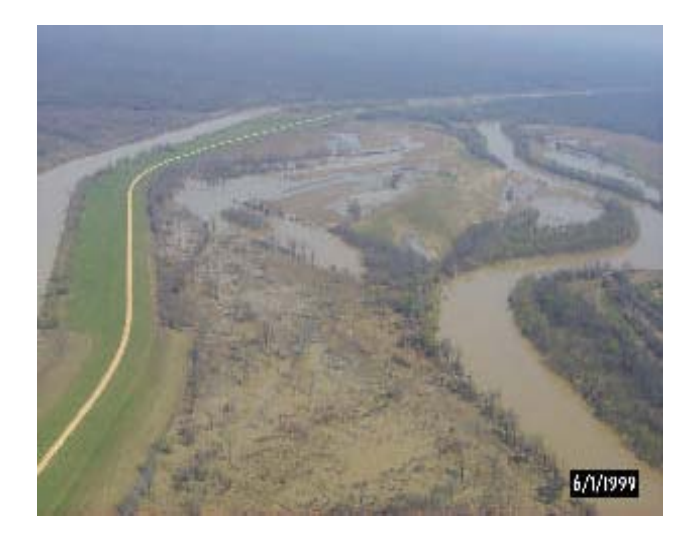
Hydrology being restored to a floodplain that had been converted to agricultural use.

The Partners Program works with private landowners and Federal and State agencies to restore the longleaf pine ecosystem on private and tribal lands. Reforestation costs $145 per acre.