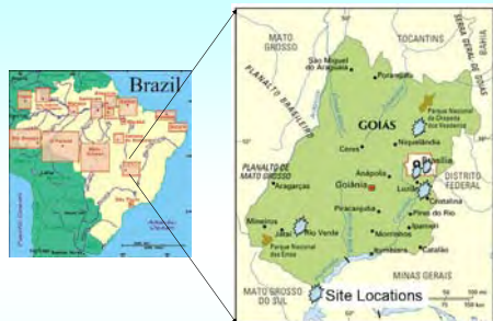
Figure 1. Sites included in the Large Scale Biosphere–Atmosphere Experiment in Amazonia (LBA). The EPA–UnB project is located near Brasília, the capital of Brazil.

A team of U.S. Environmental Protection Agency (U.S. EPA) and Universidade de Brasília (UnB) ecologists is part of the Large Scale Biosphere–Atmosphere Experiment in Amazonia (LBA). The LBA project was created through an international cooperative agreement and includes participants from Brazil, other Amazonian countries, the U.S., and European nations. The LBA participants have conducted research at the atmospheric and soil levels at locations distributed throughout the Amazonian rain forest and the Cerrado (Figure 1). The Cerrado of central Brazil (Figure 2) is one of the largest savannah regions on earth. The “stressors” affecting ecosystems in this region, including deforestation, fire, soil degradation, unwise agricultural practices, climate change, and urbanization, are also experienced in many U.S. ecosystems (Figure 3). Intense agricultural activities, such as land clearing for soybean cultivation and cattle farming, are rapidly changing the Cerrado. U.S. EPA and UnB scientists have been collaborating in central Brazil (Figure 1) to determine how several of these stressors are affecting soil nutrient cycling, decomposition, and the soil–atmosphere exchange of carbon- and nitrogen-containing trace gases. The research is contributing data and scientific understanding for the development of models that describe these stressor–ecosystem interactions.