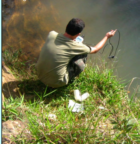
Figure 4. Stream water parameters are measured at LBA cerrado sites close to land undergoing agricultural and urban changes.