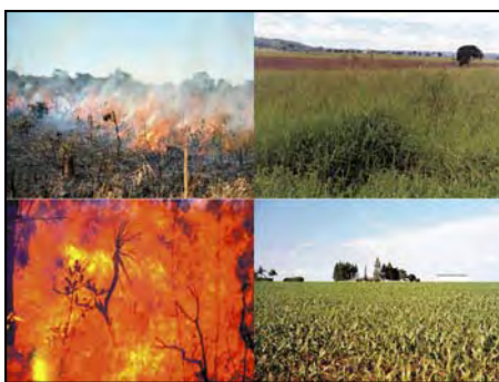
Figure 3. The Cerrado is a region of rapid land conversion, where fire is one of the most common tools utilized to clear land for both pasture and crop establishment.