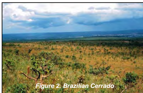
Figure 2. Brazilian Cerrado