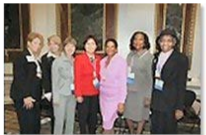
Summit participants enjoy the White House reception.