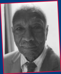
Judge Robert L. Carter

F ifty years ago, Linda Brown, a black third-grader in Topeka, Kansas, was barred from attending her neighborhood elementary school. Her small-town story would provide the legal basis for dismantling racial segregation in schools and public facilities throughout the country. On behalf of Linda's father and nearly