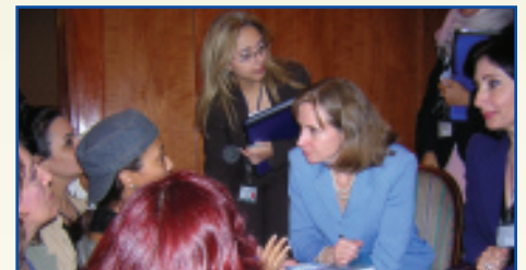
Under Secretary Dobriansky with participants of the Business Women's Summit in Tunis, Tunisia, May 24, 2005.

Women working together can build the kind of partnerships and business ties that can most effectively meet their cultural and societal needs. The Middle East and North Africa Business Women's Summit gave women a space to carve out their own vision for a brighter, more secure, and prosperous future.