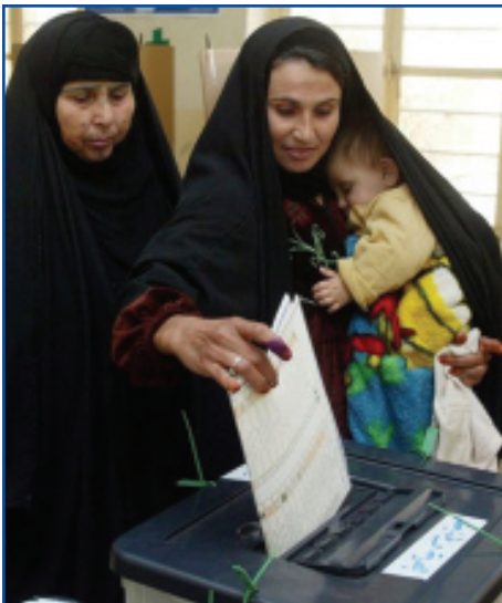
Iraqi women voting January 30, 2005.