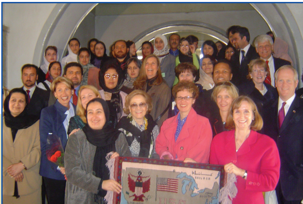
Under Secretary of State for Global Affairs Paula Dobriansky (right front), and Afghan Minister of Women's Affairs, Massouda Jalal (left front), Co-chairs of the U.S.-Afghan Women's Council, with participants at the Council meeting in Kabul, Afghanistan on March 29, 2005.

The Council's overarching goal is to help Afghan women secure political rights and economic opportunity, but these two pillars must be supported by a strong foundation of education and health. The Council show-cased three new education initiatives, the Women's Teacher Training Institute, the opening of a U.S.-style high school, and the inauguration of an American University in Kabul. U.S. First Lady Laura Bush said, "the lack of literacy hobbles all progress for women, legal awareness, economic and political empowerment, even life expectancy. Educating women is especially urgent leading up to the Fall 2005 parliamentary elections."