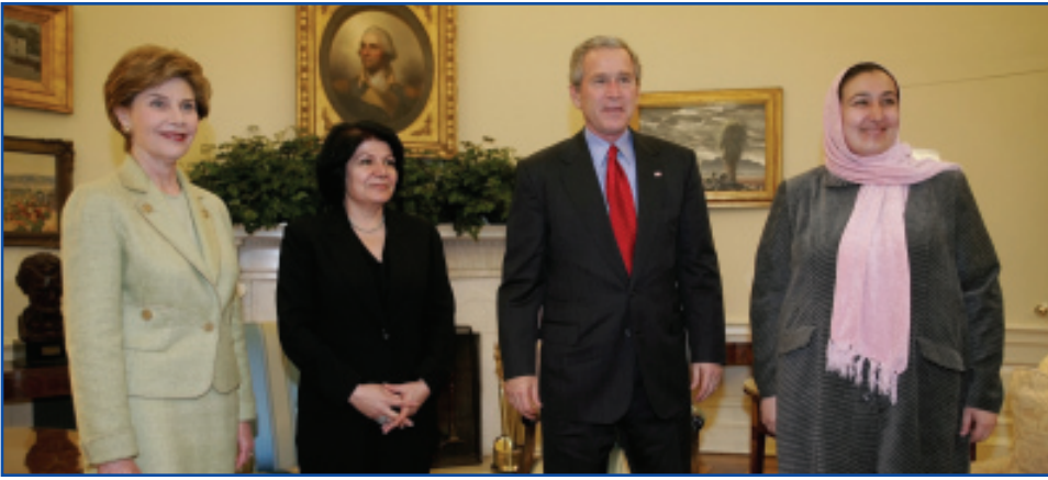
U.S. President Bush and First Lady Laura Bush meet Afghan Minister of Women's Affairs, Massouda Jalal (far right), and Iraqi Minister of Women's Affairs, Narmin Othman (second from left) at the White House.

Secretary Rice and Ministers Jalal and Othman delivered remarks.