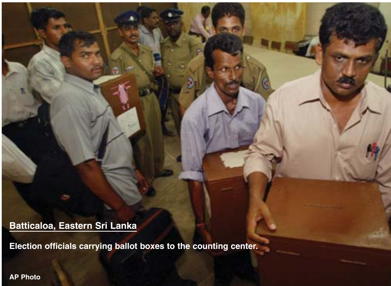
Batticaloa, Eastern Sri Lanka

The United States funded a conference for Sri Lankan criminal justice personnel to enhance their professional capabilities to prevent the trafficking of women and exploitation of children. The Sri Lankan National Child Protection Agency and Embassy organized a conference that featured presentations by three U.S. Government criminal justice experts in the field.