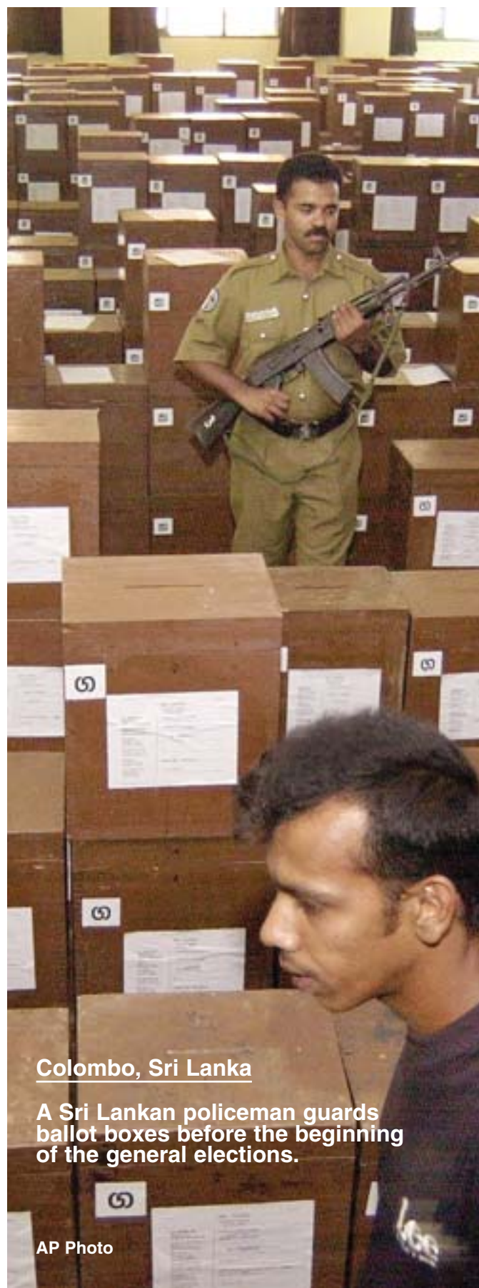
Colombo, Sri Lanka