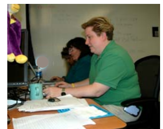
Testers participating in Cycle 1 in Herndon, VA

August 20 to September 14 and involves the PMO, as well as bureau representatives and NBC. Errors identified in Cycle 1 are retested. It also includes other system features such as year-end processing and 508 compliance.