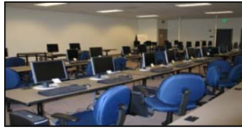
New Training/Testing Center in Denver, CO

FBMS project, Road Shows convey more targeted information to deploying bureaus on how the FBMS transition will impact them on the bureau level.