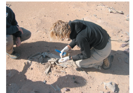
Anthropological exhumation of remains by coalition team member.

The first phase of the plan, carried out in the first weeks after the war, addressed the need for public awareness and education. Military and CPA investigators, attorneys and forensic experts engaged in extensive efforts to collect, coordinate and verify information on reported mass graves. In addition, the media, nongovernmental organizations (NGOs), and local and religious leaders helped alert Iraqis to the importance of the sites and the need to preserve them undisturbed, and encouraged individuals to come forward with information about suspected sites. When necessary, military and civilian teams deployed to key sites to assist local leaders counsel patience and encourage orderly methods of recovery. Limited training was provided to mitigate damage to sites overrun by an emotional population, including: