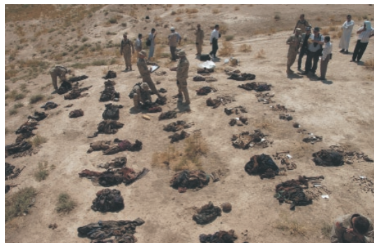
Examination of mass grave sites by the coalition team and local Iraqis.

Mass graves in Iraq are characterized as unmarked sites containing at least six bodies. Some can be identified by mounds of earth piled above the ground or as deep pits that appear to have been filled. Some older graves are more difficult to identify, having been covered by vegetation and debris over time. Sites have been discovered in all regions of the country