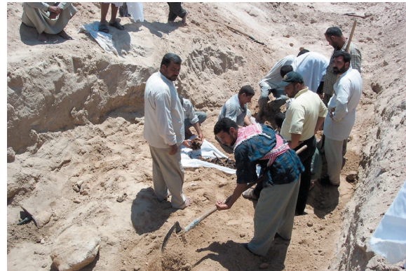
Local Iraqis examining remains.

International teams will conduct the exhumations and, whenever possible, work alongside Iraqis to train them to conduct future exhumations themselves. The Swedish government has expressed willingness to donate a tenting system to house forensic teams on-site during their work.