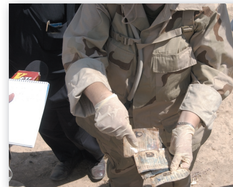
Examination of evidence by CPA member.

Iraqis are also discussing how they will prosecute the perpetrators of crimes against humanity and war crimes in Iraq through an Iraqi-led process assisted and supported by the international community.