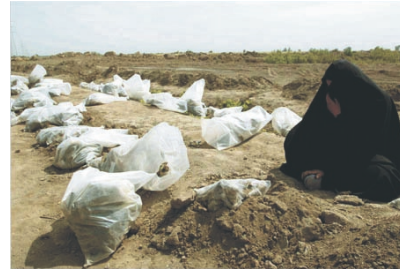
An Iraqi woman mourns next to remains of bodies exhumed from a mass grave.

and contain members of every major religious and ethnic group in Iraq as well as foreign nationals, including Kuwaitis and Saudis. Over 250 sites have been reported, of which approximately 40 have been confirmed to date. Over 1 million Iraqis are believed to be missing in Iraq as a result of executions, wars, and defections, of whom hundreds of thousands are thought to be in mass graves.