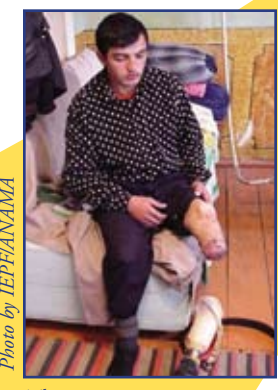
This mine victim, interviewed during the survey, was a child when his accident happened.

The mine victims were grouped in accordance with their degree of disability, social state, scope of interest, abilities and principal needs. One hundred eighty survivors expressed a desire to start and run a small business. About 80 mine victims wished to become involved with mine-risk education servic-