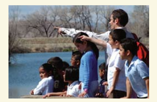
Rocky Mountain Arsenal National Wildlife Refuge has environmental and interpretive programs targeted to Hispanic communities.

In December 2006, the complex's newest visitor center opened right on the U.S.-Mexico border, a short walk across a suspension bridge to Ciudad Miguel Aleman. All exhibits, brochures and signs are bilingual. "Not only do we want to welcome U.S. residents who speak only