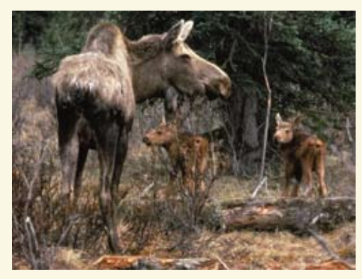
Predators – people, wolves and bears – are blamed for the failure of the moose population to grow at Yukon Flats National Wildlife Refuge in Alaska.