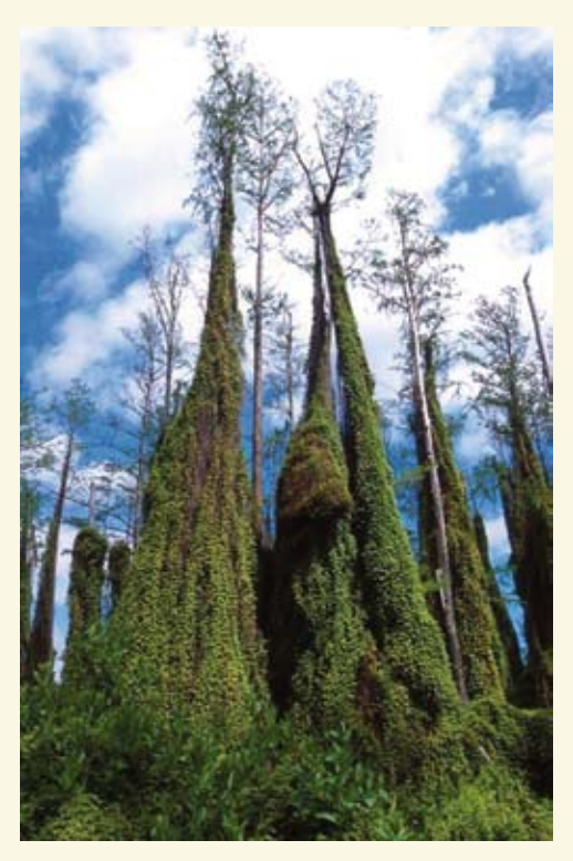
Arthur R. Marshall Loxahatchee National Wildlife Refuge has just received $7 million in exotic control funding from Florida to help tackle invasive plants including melaleuca and lygodium fern. The fern smothers native vegetation and is virtually impossible to eradicate.

"If untreated, lygodium will decimate the habitats of South Florida," says Miller. The roots can be six feet deep, affecting water drainage. It grows up into the canopy and affects fire ecology because it's a ladder fuel. And on the ground, turtles get stuck in the fern.