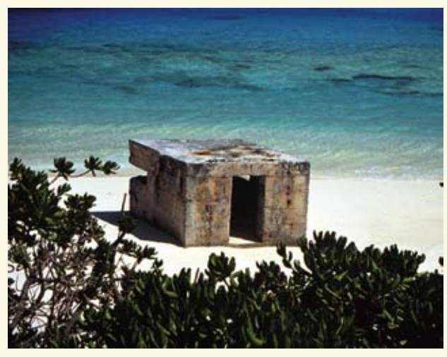
Pillboxes are among historic buildings on Midway Atoll Refuge

Now Midway Atoll Refuge is also part of the new Papahānaumokuākea Marine National Monument, established in 2006 by President Bush as the largest marine protected area in the world. Currently, Midway welcomes only a few visitors on preapproved cruise ships or those willing to volunteer on the refuge for three months at a time.