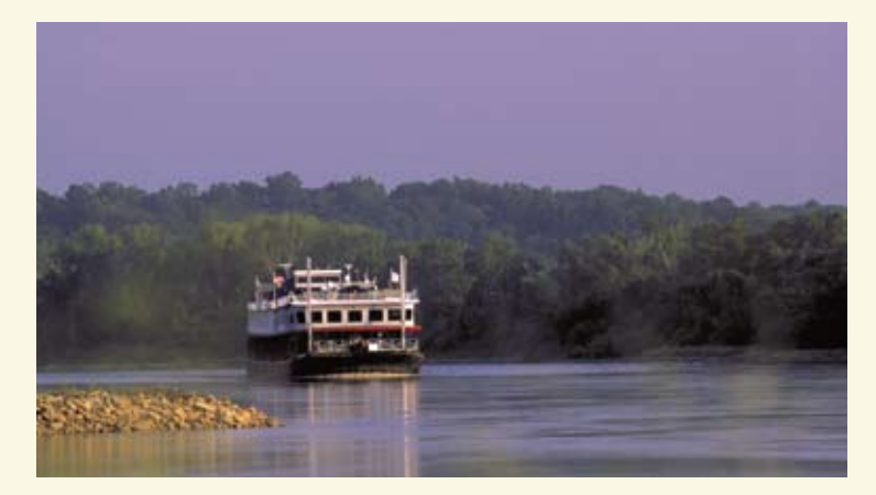
River Explorer, a barge-hotel run by RiverBarge Excursions, passes through Aransas Refuge as it sails the Gulf Intracoastal Waterway.

to develop a stronger connection with RiverBarge but she is also busy with other ecotourism opportunities on the refuge. The refuge, which hosts 60,000 visitors a year, provides information about three tour boat companies that offer regular day trips through Aransas Refuge during whooping crane season. Several of the naturalists on these boats are refuge volunteers.