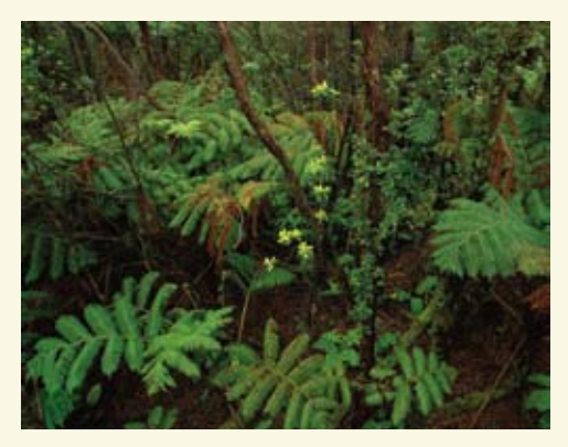
At this stage in its restoration, Hakalau Forest National Wildlife Refuge in Hawaii is largely koa forest, home to eight brilliantly colored by endangered bird species and 12 endangered plant species.

After dodging gorse, feral cattle, feral pigs and a staggering number of ground-dwelling birds native to Europe