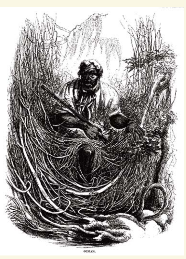
The remains of largely self-sufficient "maroon" communities have been found on Great Dismal Swamp Refuge. (David Strother)

The number of slaves who fled to the swamp — then widely regarded as a fearsome place thick with impenetrable bogs and bloodthirsty beasts