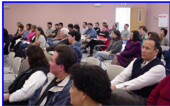
Right: OST staff are honored for their exceptional document production efforts.