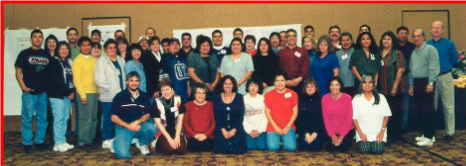
The Office of Trust Records Team

All three office divisions within OTR participated in the training sessions, including the Records Management, Electronic Records, and the Research, Litigation and Settlement Divisions.