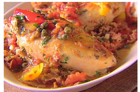
Recipe courtesy Giada De Laurentiis

tainer, cool, and refrigerate. The next day, reheat the chicken to a simmer over medium heat. Stir in capers and parsley and serve.