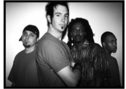
Villanova, local favorite playing October 30

The NAC Shuttle starts running at 5:45 PM to 5 Points with the last returning shuttle to the NAC leaving 5 Points at 10:52 PM. This is a FREE service!!!