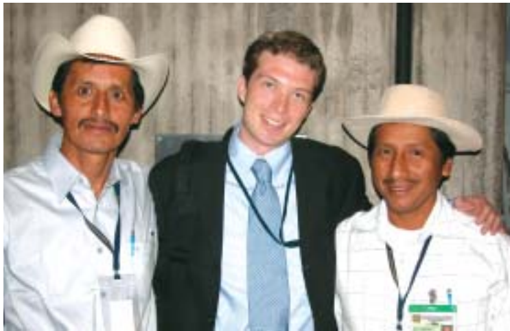
Above: A guide lectures on historical sites in Quito. Bottom left: The author poses with two conference participants who are leaders of an Ecuadorian indigenous farmers coalition.

“It has been the experience of a lifetime to attend this conference and openly exchange ideas with young people from other countries who share a similar desire to improve the politics in Latin America.”