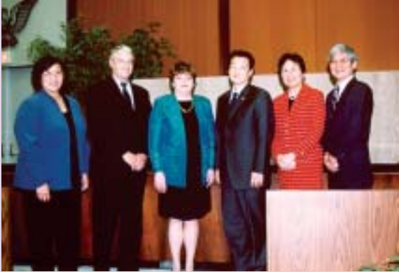
Speakers at the INR workshop.