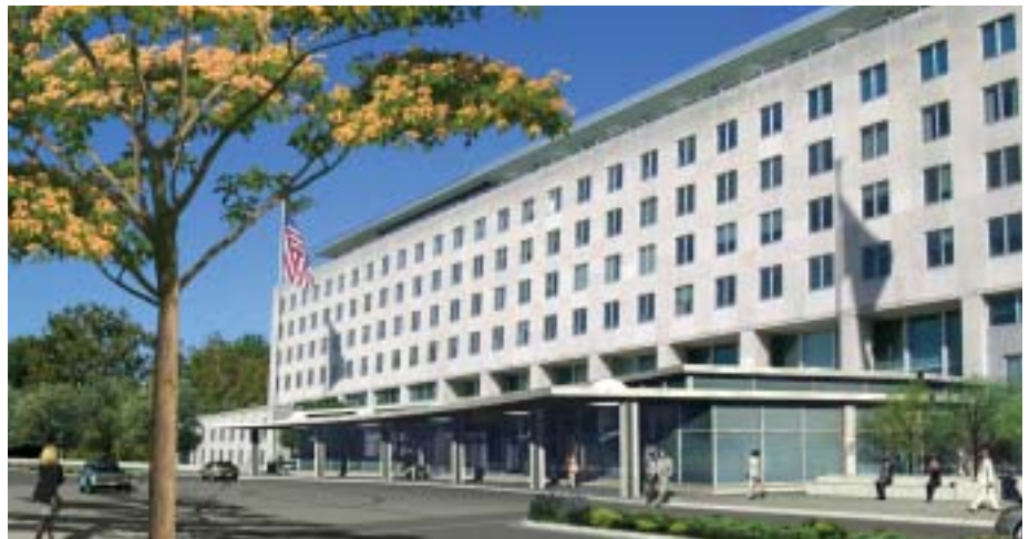
Artist rendering of proposed C Street Screening Pavilion attached to New State.

The Bureau of Administration worked with Diplomatic Security, Karn Charuhas Chapman & Twohey Architects, Rhodeside & Harwell Landscape Architects and Robinson & Associates Historic Preservation Consultants in managing the improvements to be added incrementally during seven phases of construction to minimize disruptions.