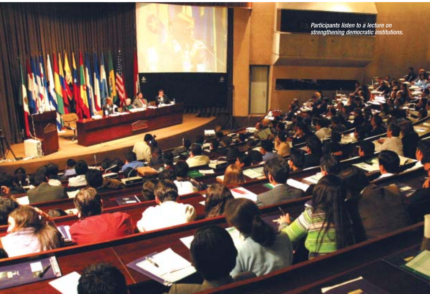
Participants listen to a lecture on strengthening democratic institutions.