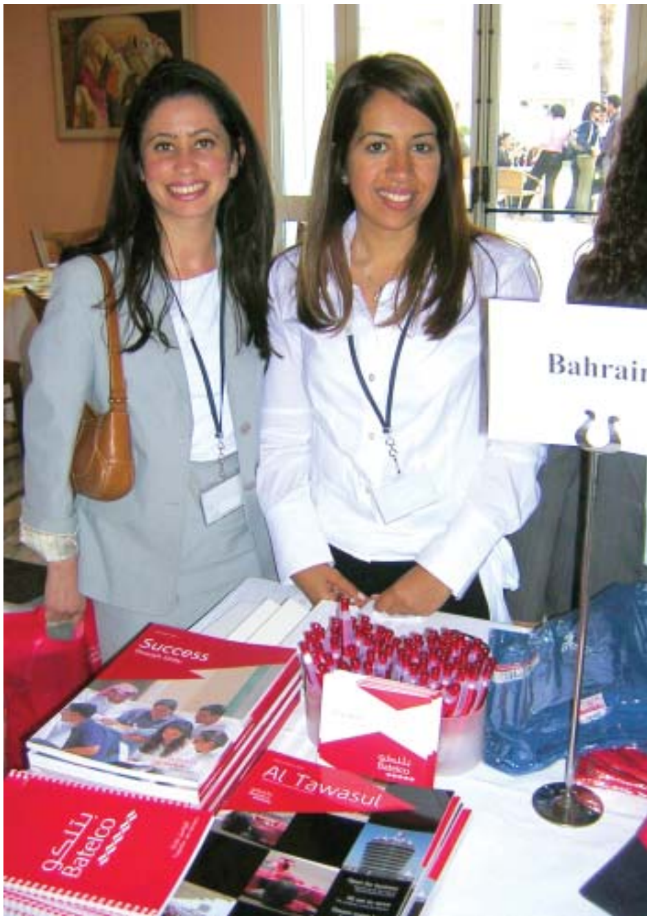
Top: Two Bahraini business owners at a business summit for Arab women in Tunis promote their services. Bottom: Children receive lessons in critical thinking.

funded to organize grassroots campaigns for the fall parliamentary campaigns.