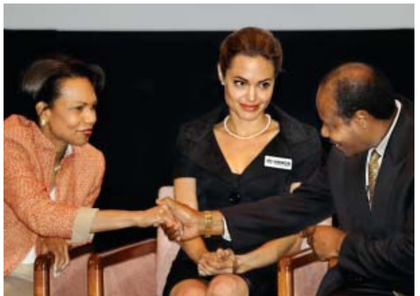
Secretary of State Condoleezza Rice, left, greets Paul Rusesabagina, the heroic innkeeper who turned his hotel into an impromptu refugee camp during the genocide in Rwanda, joined at center by actress Angelina Jolie, a goodwill ambassador for the United Nations High Commissioner for Refugees.

In 2001, Ms. Jolie approached the U.N. about becoming involved in refugee assistance. Since then, the Golden Globe and Academy Award winner has visited more than 15 nations, including Sierra Leone, Kenya, Kosovo and Chad. Named the Goodwill Ambassador for the U.N. High Commissioner for