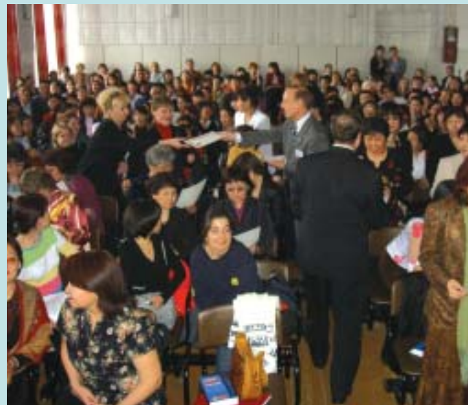
Left: A student pays close attention at a Kyzyl workshop. Above: Participants receive certificates after completing the conference. Below: The Center of Asia Monument in Kyzyl draws the English language office team.