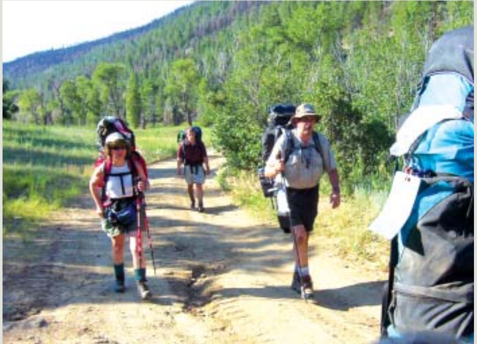
Trekking the high adventure trail at the Philmont Boy Scout camp in Cimarron, New Mexico.

To pay for the numerous trips to the outback, including the coveted World Jamborette in Scotland, her scouts raise money selling crafts, soda and doughnuts at local events