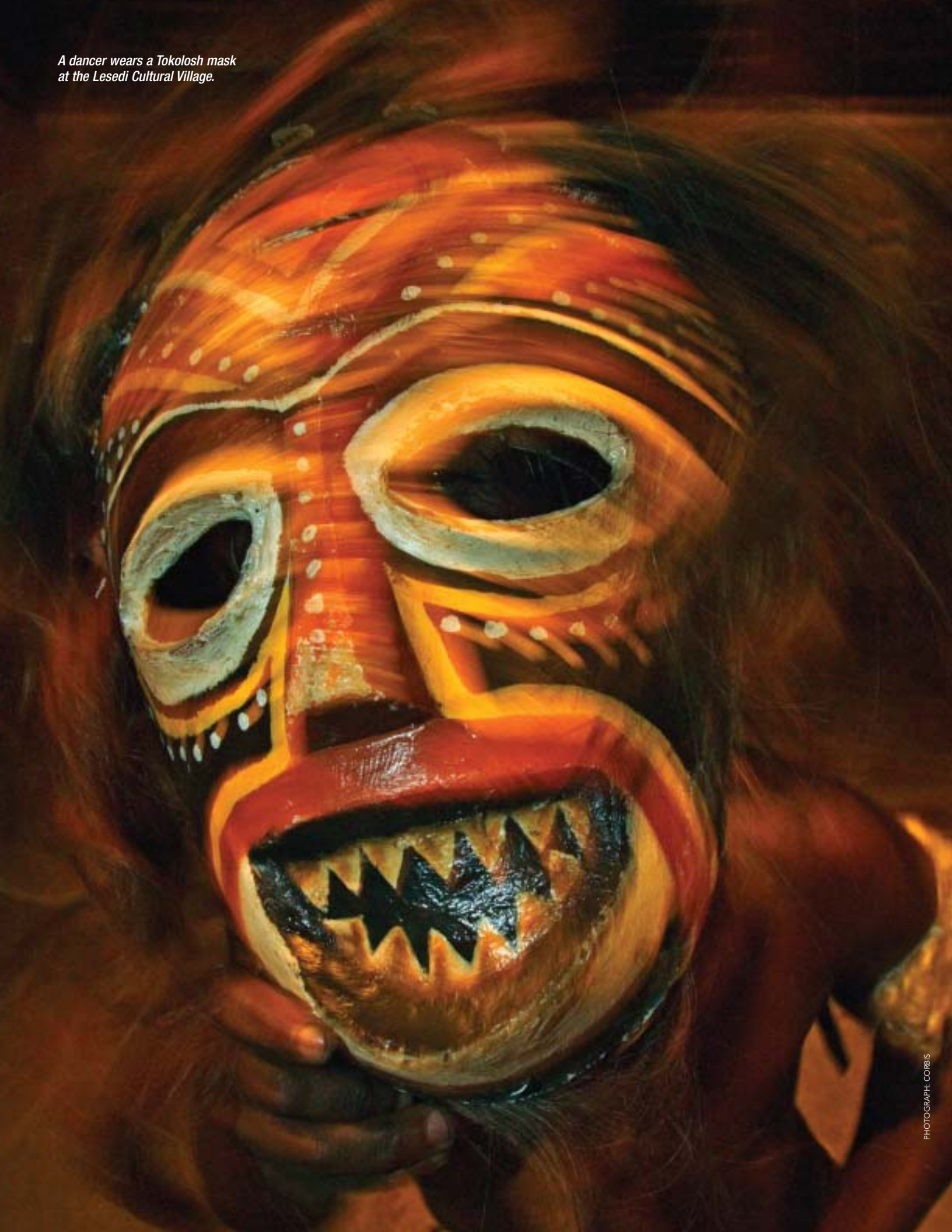
A dancer wears a Tokolosh mask at the Lesedi Cultural Village.