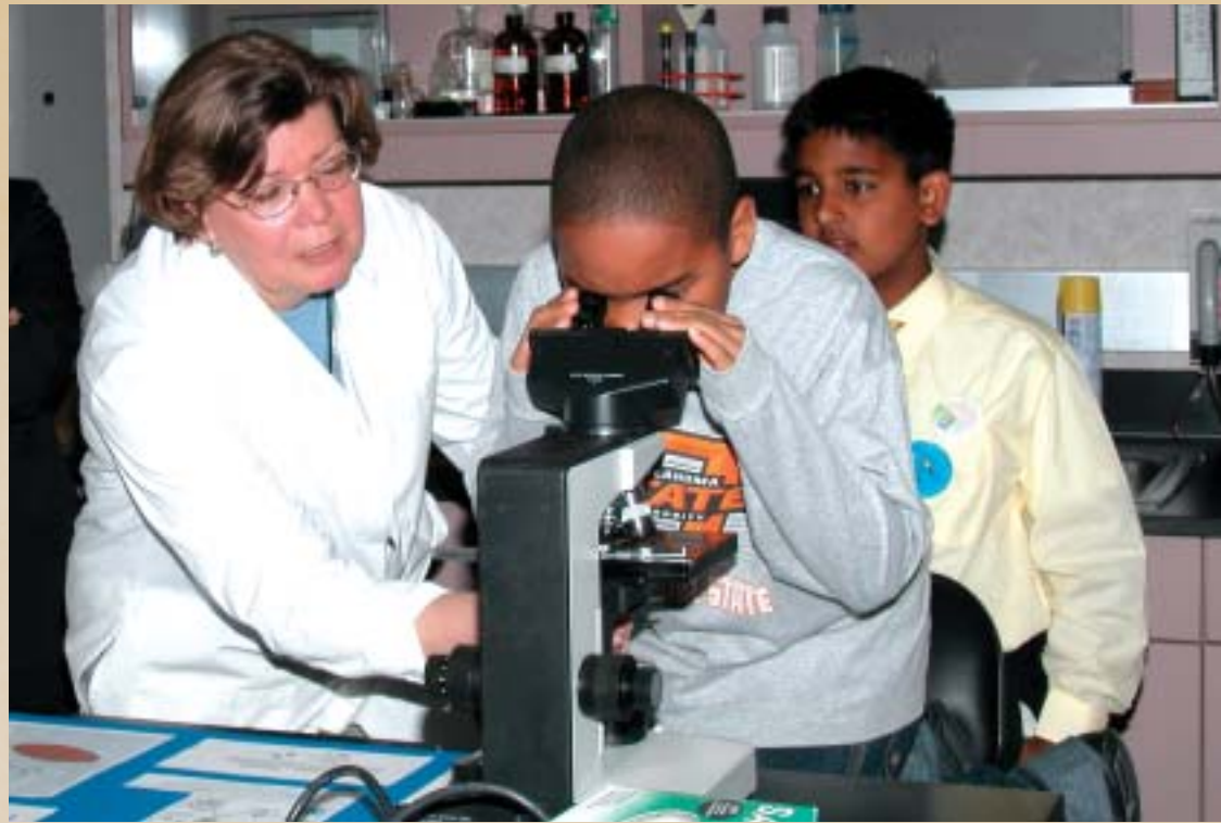
Above: The Office of Medical Services gave children first-hand looks at blood cells, parasites and other cool and interesting things. Below: Enjoying the spectacular view of Washington, D.C. and Rosslyn, Va. from the chancery of the German Embassy.