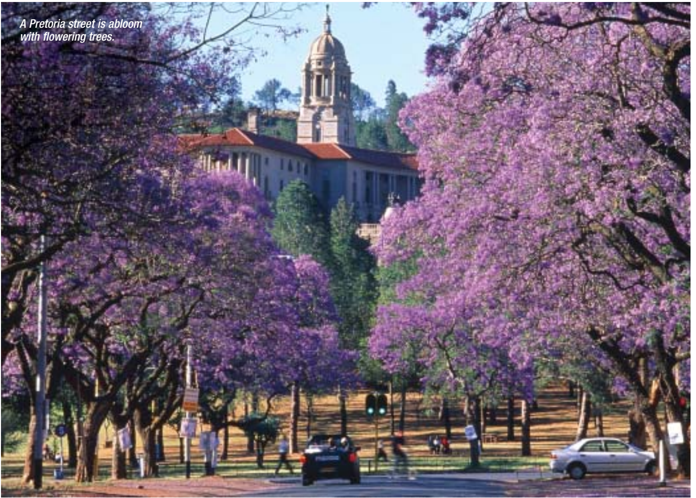
A Pretoria street is abloom with flowering trees.