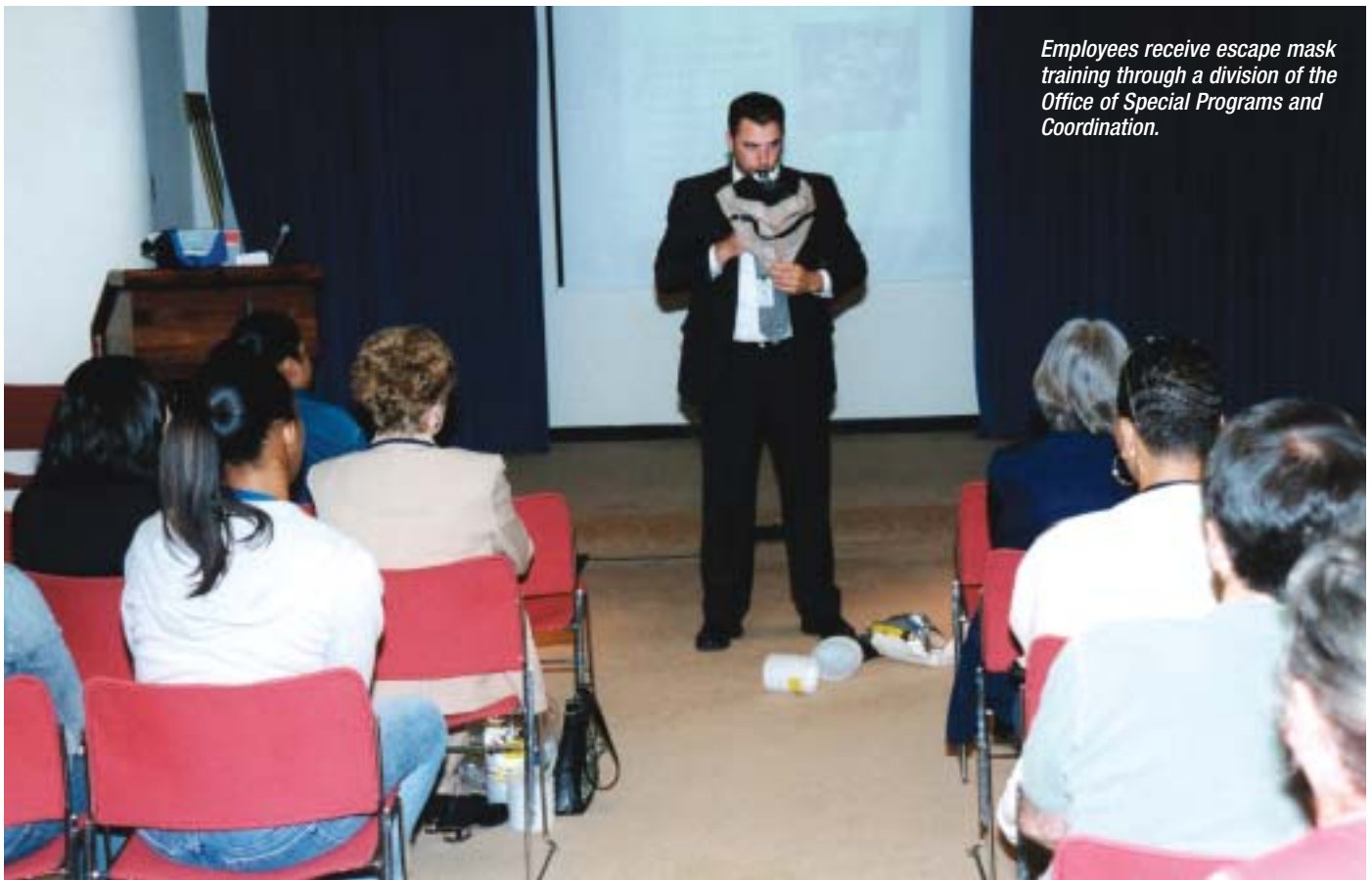
Employees receive escape mask training through a division of the Office of Special Programs and Coordination.

Office staff also represent Diplomatic Security and overseas missions at three of the military's combat commands: CENTCOM (Central Command), EUCOM (European Command) and PACOM (Pacific Command). Like their colleagues in the special operations and emergency planning branches, these liaison officers handle evacuation and security issues and service posts that may be in danger. They offer