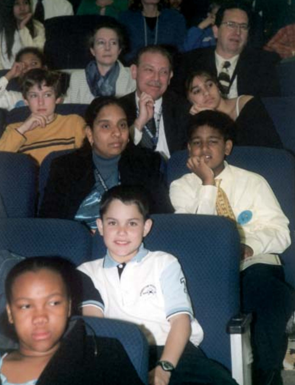
Children and parents alike prepare for the day's adventure