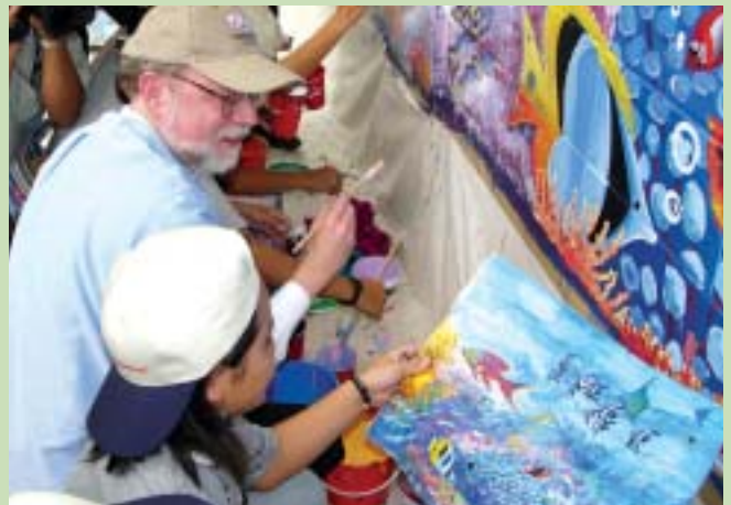
Ambassador Boyce adds finishing touches to a section of the embassy wall.

newspapers featured the colorful murals. Young people, including those from the tsunami-ravaged South, the drought-plagued Northeast, flood-prone Bangkok and hill tribe kids from the North, answered the call to turn walls into something far more colorful and meaningful. Ambassador Boyce and Consul General Camp joined in, too, along with the mayor of Chiang Mai, who called the event "a model" for the city and later arranged for the municipal art center to display the murals for a month.