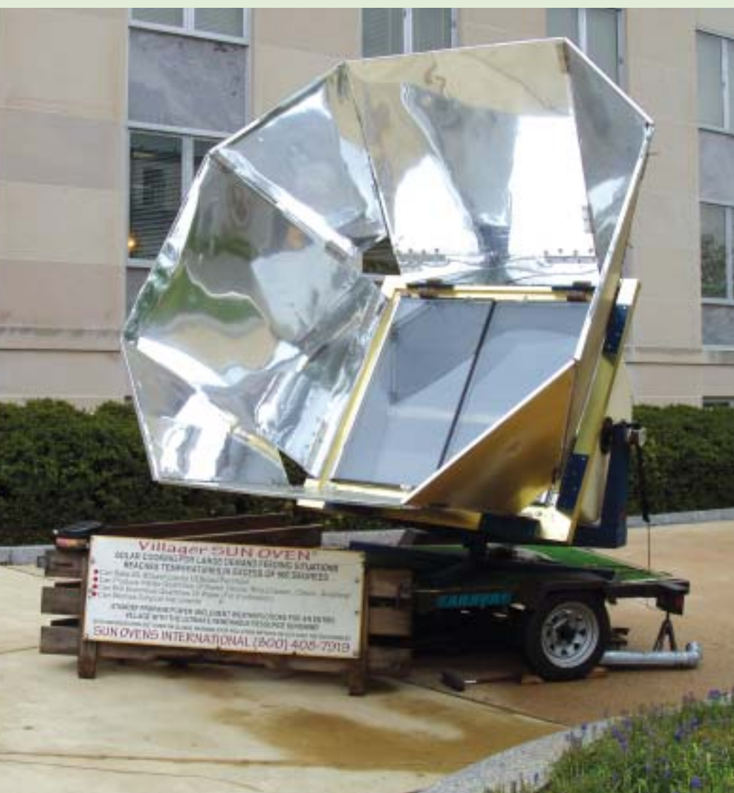
It was too cloudy for students from the Miami Country Day School to bake cookies in the huge sun oven set up outside the Truman building. But their enthusiasm for the technology was obvious. They have raised money to send solar-powered ovens to victims of the recent tsunami, as well as people in Afghanistan, Honduras and Haiti. The ovens can help prevent deforestation in regions where wood and charcoal are primary fuel sources.