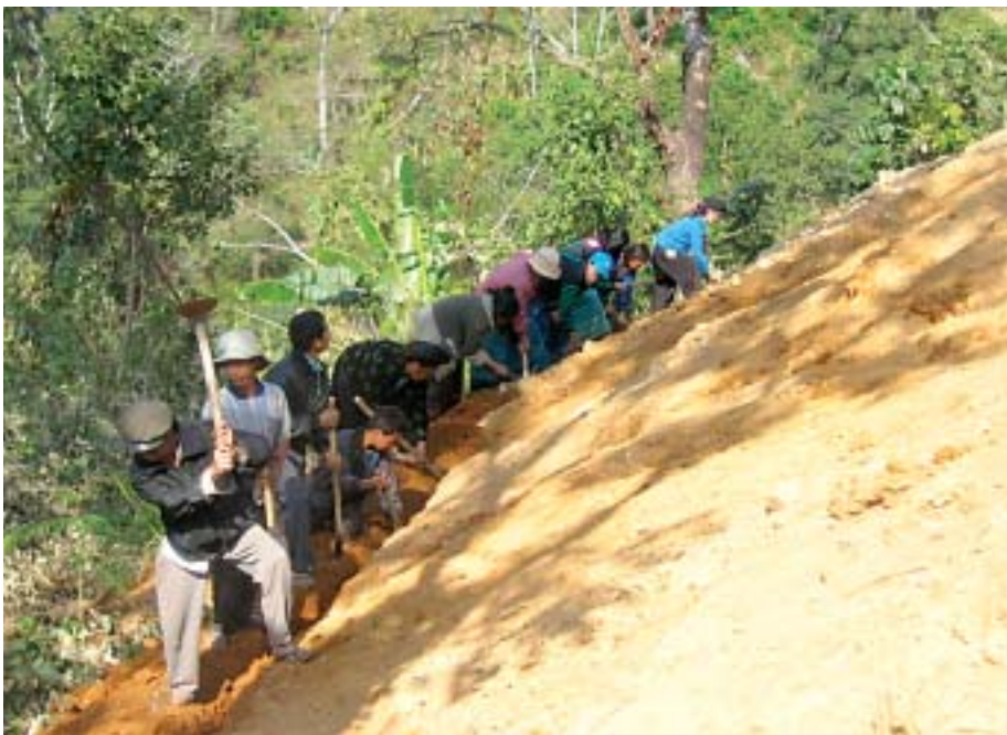
Villagers contribute in-kind labor for a new clean water system.

Detoxification is just the first step for addicts. District and provincial health