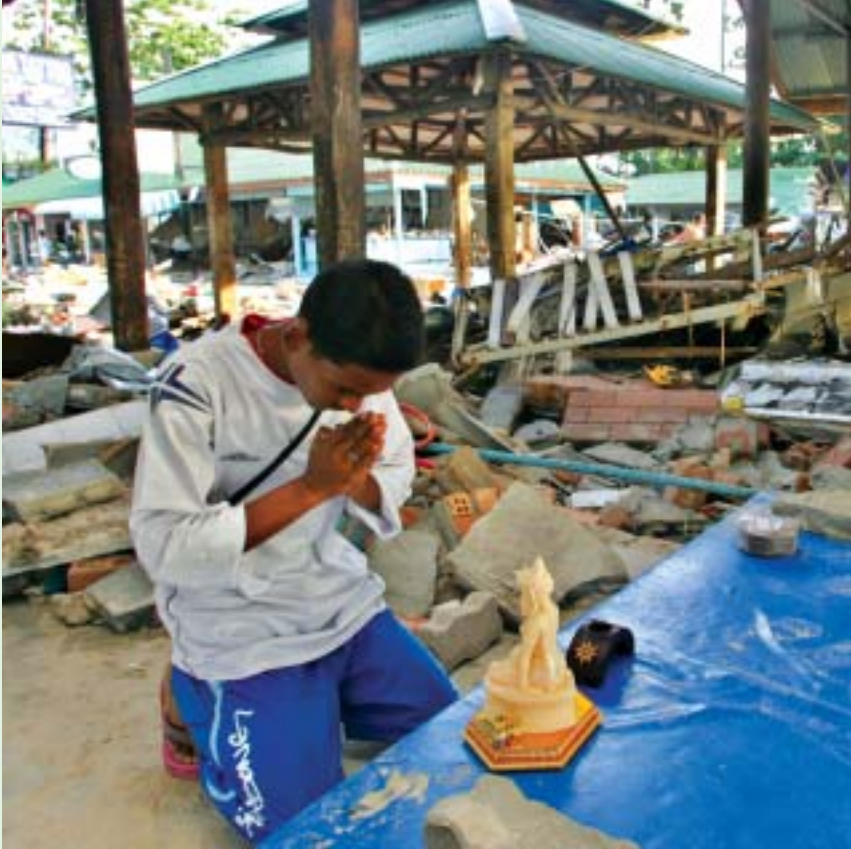
Above left: A Thai man prays inside a damaged shop on the Thai island of Phuket. Center: Injured foreign tourists are sent to a hospital after a tsunami hit Phuket. Right: A young Thai boy lights candles during a vigil for tsunami victims on Patong beach.

placed on victim recovery and humanitarian aid, so it helped us enormously.