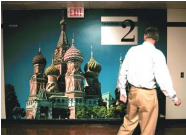
One employee out for exercise barely breaks stride as he passes a mural.

See http://med.state.gov/common/health_overseas/walk_programs/inside_main.cfm for walking tour maps.