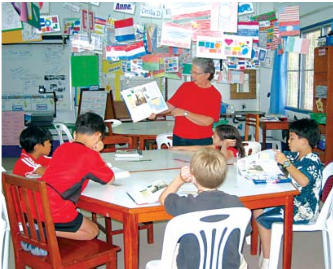
A colorful classroom is the setting for primary students studying American history.

Reaction from our children has been surprisingly positive. Reportedly, one of the kids came home from school and described the class as "cool," not a word we parents normally