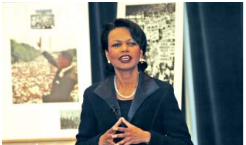
Secretary Rice speaks of the values that sustained her family and other African-Americans.