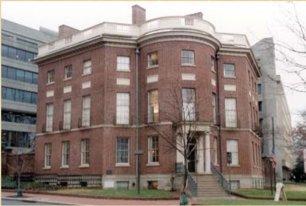
Above: The Octagon House on New York Avenue was a Department annex during World War II. Below: The George C. Marshall wing of Main State was once known as New State. Surrounded by a construction fence, it is under renovation.

Fifty years ago this year, Congress approved a long-dreamed-of plan to consolidate the State Department in one building. The plan would add a million square feet to the “New State Building” on 21st Street. Finally, the department locations scattered throughout the city—as many as 47 in the 1940s—could be gathered under one roof.