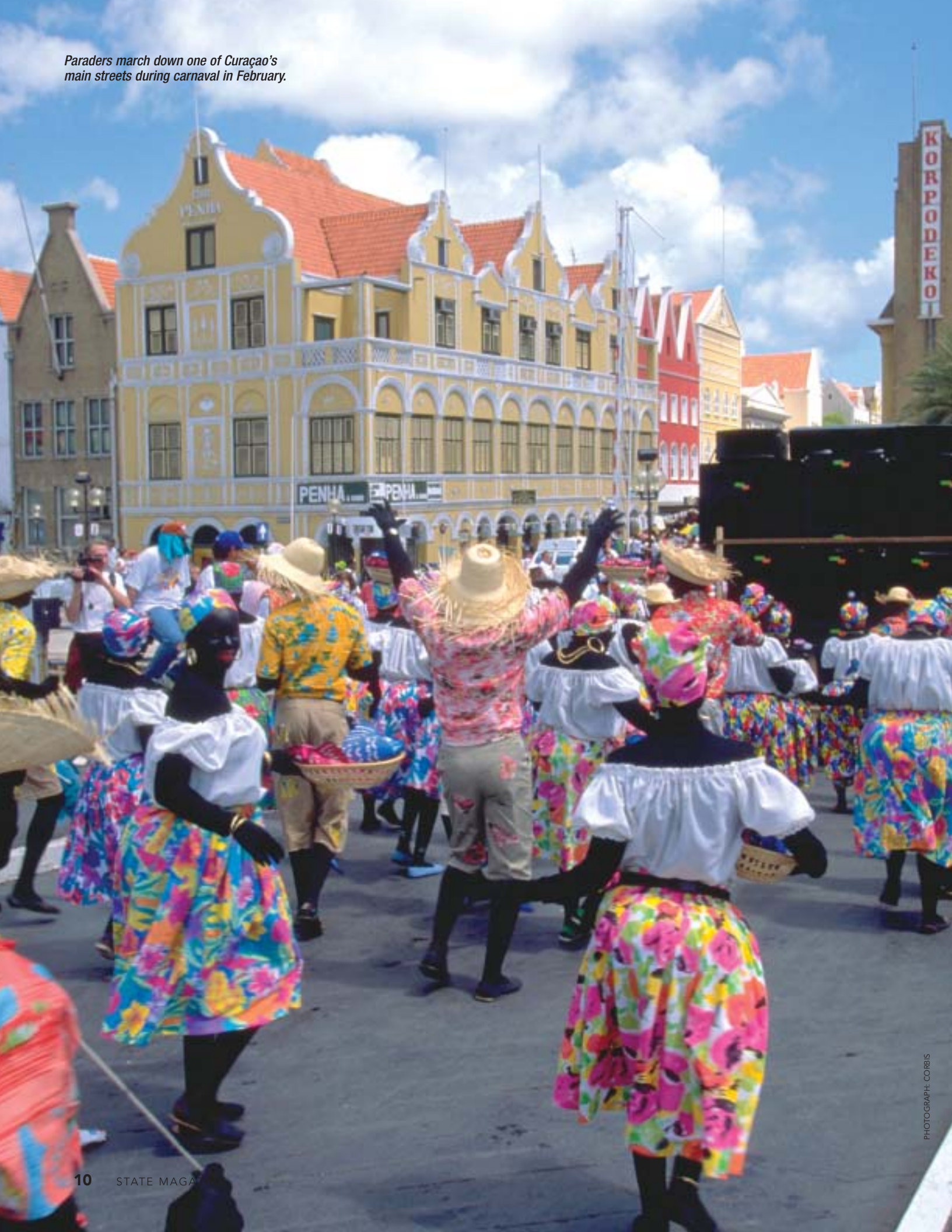
Paraders march down one of Curaçao's main streets during carnival in February.