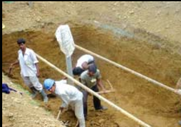
Workers dig a water collection pit on the embassy compound.

Noting New Delhi's success, other missions are starting their own rainwater-harvesting projects and energy-saving measures—diplomacy with down-to-earth results. ■