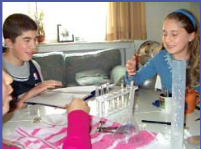
A homeschooled special-needs student, left, enjoys a science experiment.

E-mail floaskeducation@state.gov to relate your experiences with homeschooling.