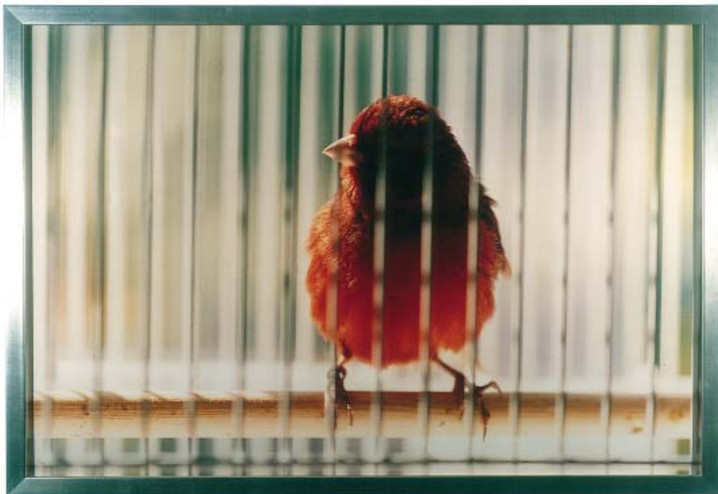
Puffy, 2002, Ernesto Pujol, Chromogenic print, 40 in. x 60 in.