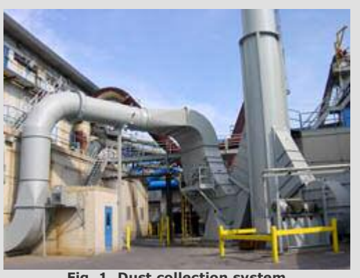
Fig. 1. Dust collection system

Employees have a high potential overexposure to lead dust due to improperly maintained dust collection systems.