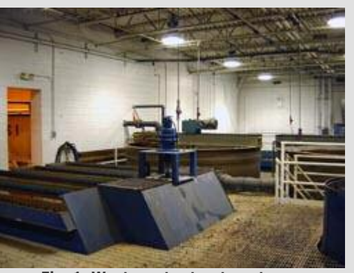
Fig. 1. Waste water treatment area