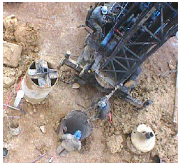
Fig. 1. Conductor hole