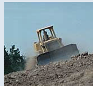
Fig. 2. Leveling uneven ground