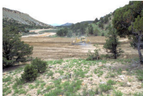
Fig. 1. Clearing the drilling site