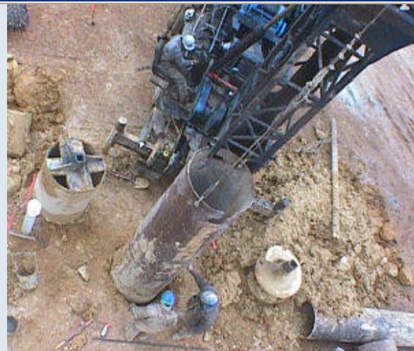
Fig. 2. Installing conductor hole casing