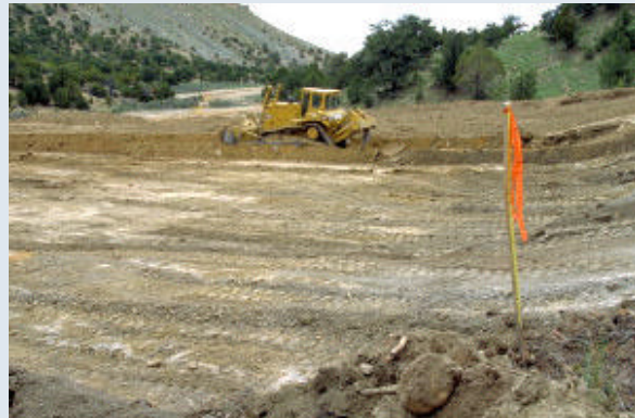
Fig. 4. Excavating at a drill site

eTool Home | Site Preparation | Drilling | Well Completion | Servicing | Plug & Abandon Well General Safety | Additional References | Viewing/Printing Instructions | Credits | JSA Safety and Health Topic | Site Map | Illustrated Glossary | Glossary of Terms