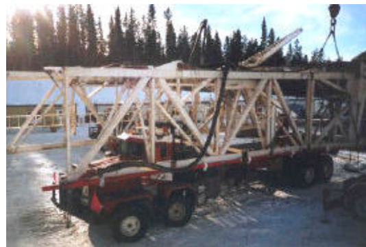
Fig. 1. Transporting equipment