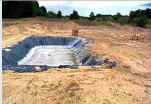
Fig. 3. Reserve pit