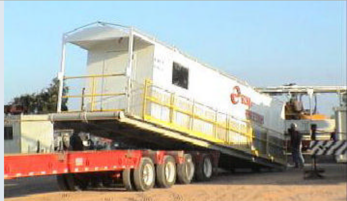
Fig. 3. Unloading doghouse

eTool Home | Site Preparation | Drilling | Well Completion | Servicing | Plug & Abandon Well General Safety | Additional References | Viewing/Printing Instructions | Credits | JSA Safety and Health Topic | Site Map | Illustrated Glossary | Glossary of Terms