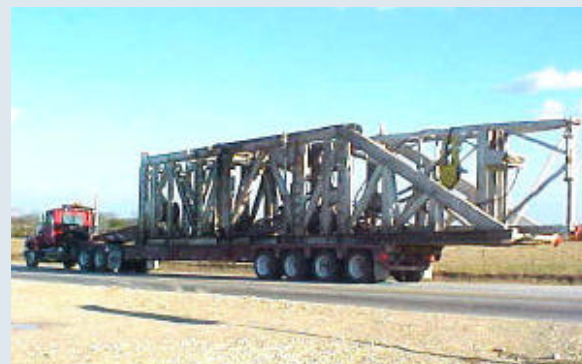
Fig. 2. Transporting derrick