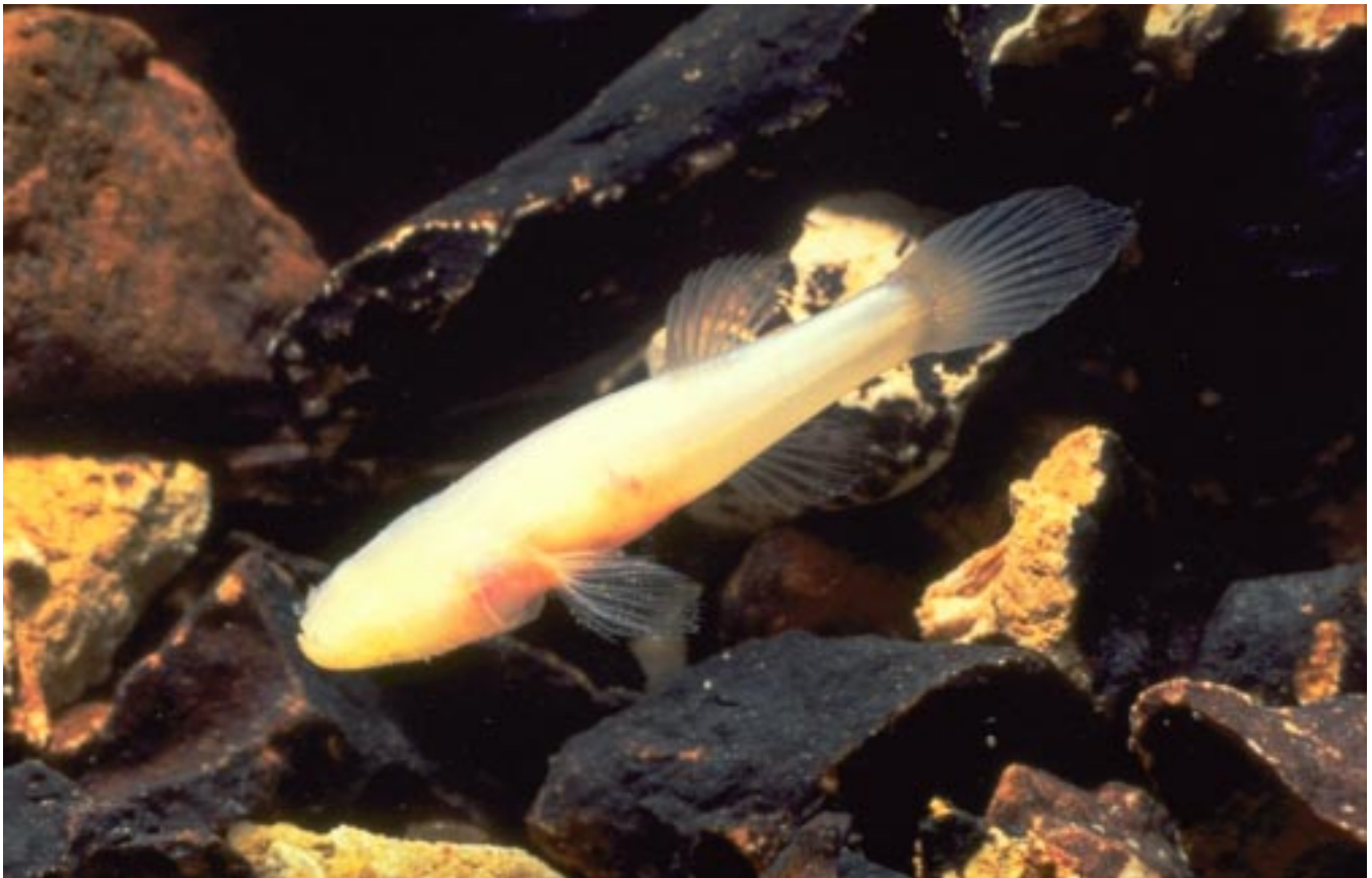
Ozark cavefish habitat has been protected through voluntary agreements with landowners.

Partnership efforts between government agencies and private organizations have protected several populations of Ozark cavefish in Benton County, Arkansas, since this species was listed as threatened in 1984. This blind, translucent fish is found in caves within the central portions of the Ozark Highlands in Arkansas, Missouri, and Oklahoma. Several private landowners, working with this alliance of agencies, have agreed voluntarily to protect caves and to help improve the groundwater on their land to assist the species. Through these efforts, several populations of Ozark cavefish have been protected in Benton County, Arkansas.