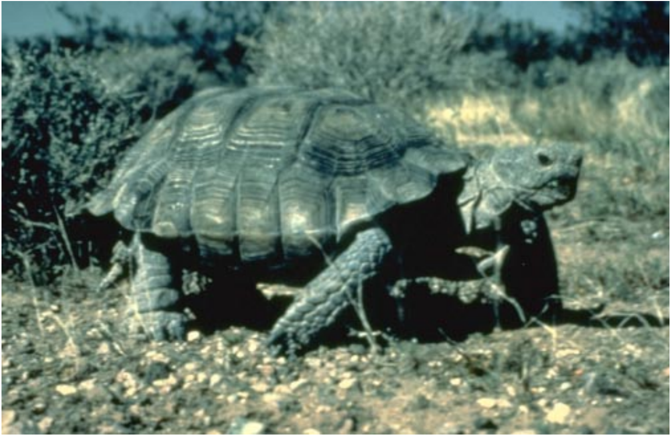
Large areas of desert tortoise habitat have been protected through cooperative efforts.