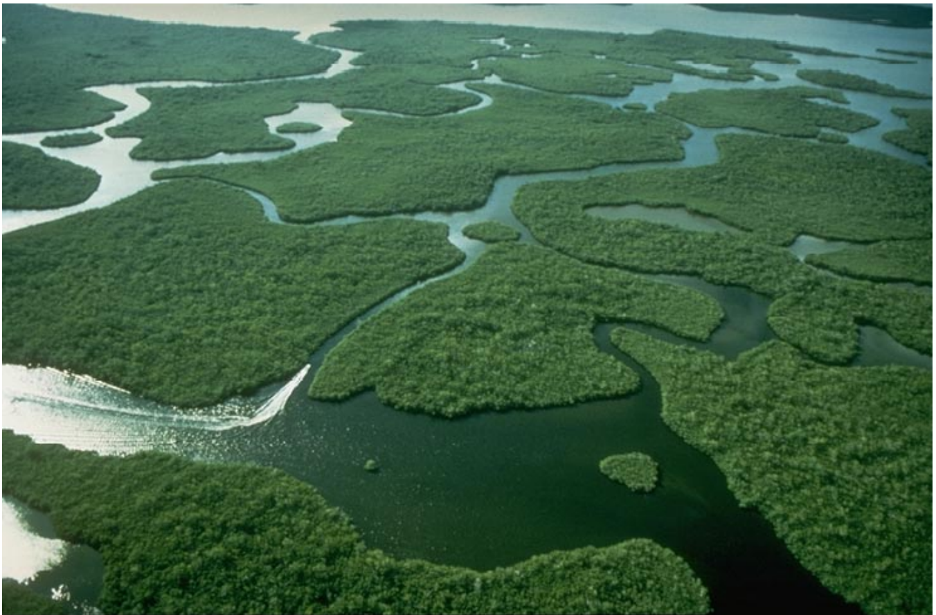
The Service, along with numerous cooperators is developing a Multi-Species Recovery Plan to address the recovery of all federally-listed species in the South Florida Ecosystem.

Seventy-two percent of the species listed as of September 30, 1996, have final recovery plans; an additional 12 percent have draft plans that outline recovery strategies.