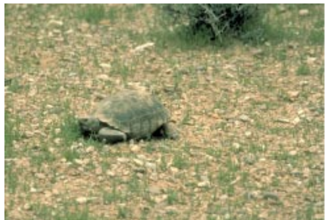
Desert tortoise

The Service is cooperating with the Bureau of Land Management to conduct numerous recovery actions for the desert tortoise. These include monitoring permanent study plots to learn about long-term population trends of the tortoise and sponsoring conferences to develop desert management practices. In addition, the Bureau of Land Management is managing its desert tortoise habitat to ensure the species' long-term protection. Research on nutrition and foraging ecology, being conducted by the Bureau of Land Management, has already been used by the Service to develop the Desert Tortoise Recovery Plan.