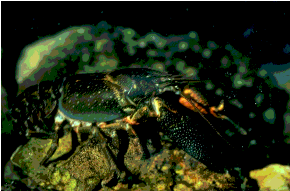
Recovery of the Shasta crayfish depends on healthy river habitats.