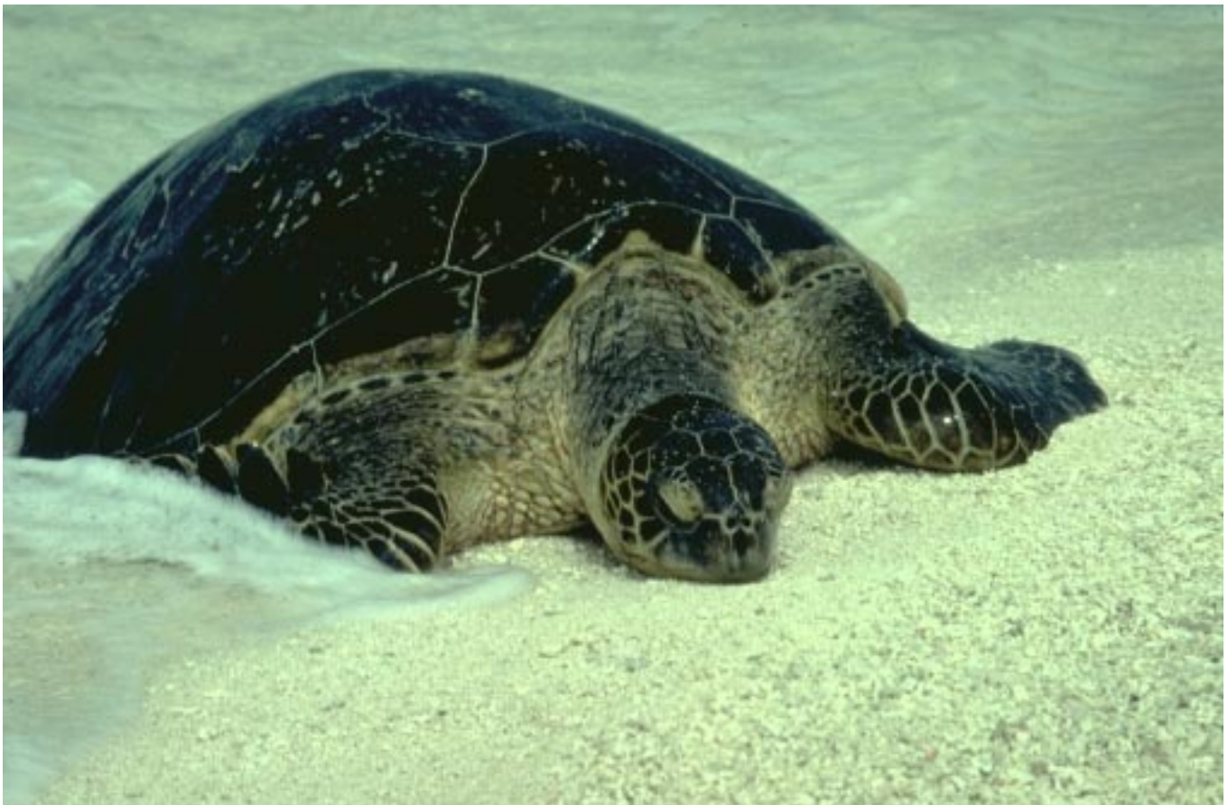
Partners from around the world participate in green sea turtle recovery efforts.

The successes of these cooperative recovery efforts are demonstrated by the fact that approximately 60 percent of the species listed between 1968 and 1973 are known currently to be stable or improving in status.