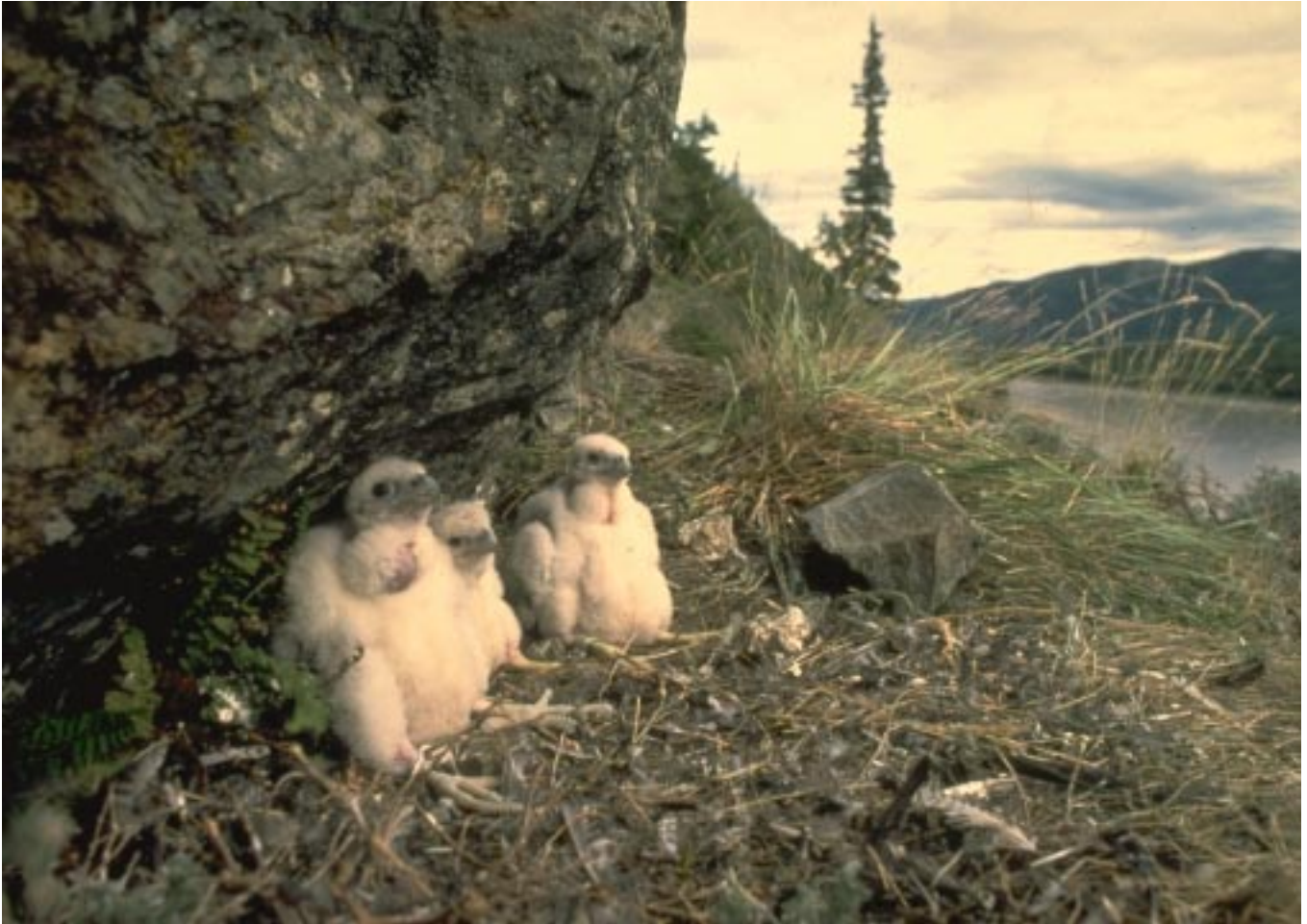
These Peregrine falcon chicks, shown nesting in the wild, are examples of successful recovery efforts.