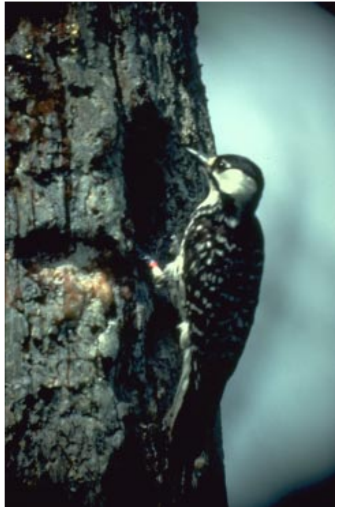
Red-cockaded woodpecker poises at the entrance to one of the nest cavities developed as part of a recovery effort.

The Service, through its recovery program and with cooperators, works to stabilize, conserve, and recover listed species by securing their populations, reversing declining numbers, and stabilizing species so that they are no longer in danger of extinction. The participation of Federal, State, and local agencies, Tribal governments, conservation organizations, the business community, landowners, and other concerned citizens has been critical to the stabilization and recovery of these plants and animals.