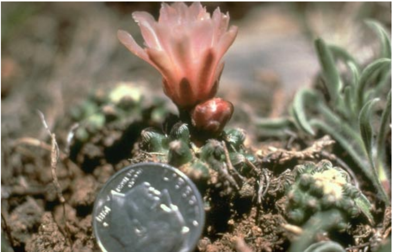
A new Knowlton cactus seedling now can be seen because of the recovery efforts that involved the Service, the State of New Mexico, and the Bureau of Land Management.

A second reintroduced population of the Knowlton cactus is being established, and there currently are 69 seedlings produced from seeds from the first site. The Service, State of New Mexico, and Bureau of Land Management all have participated in this project.