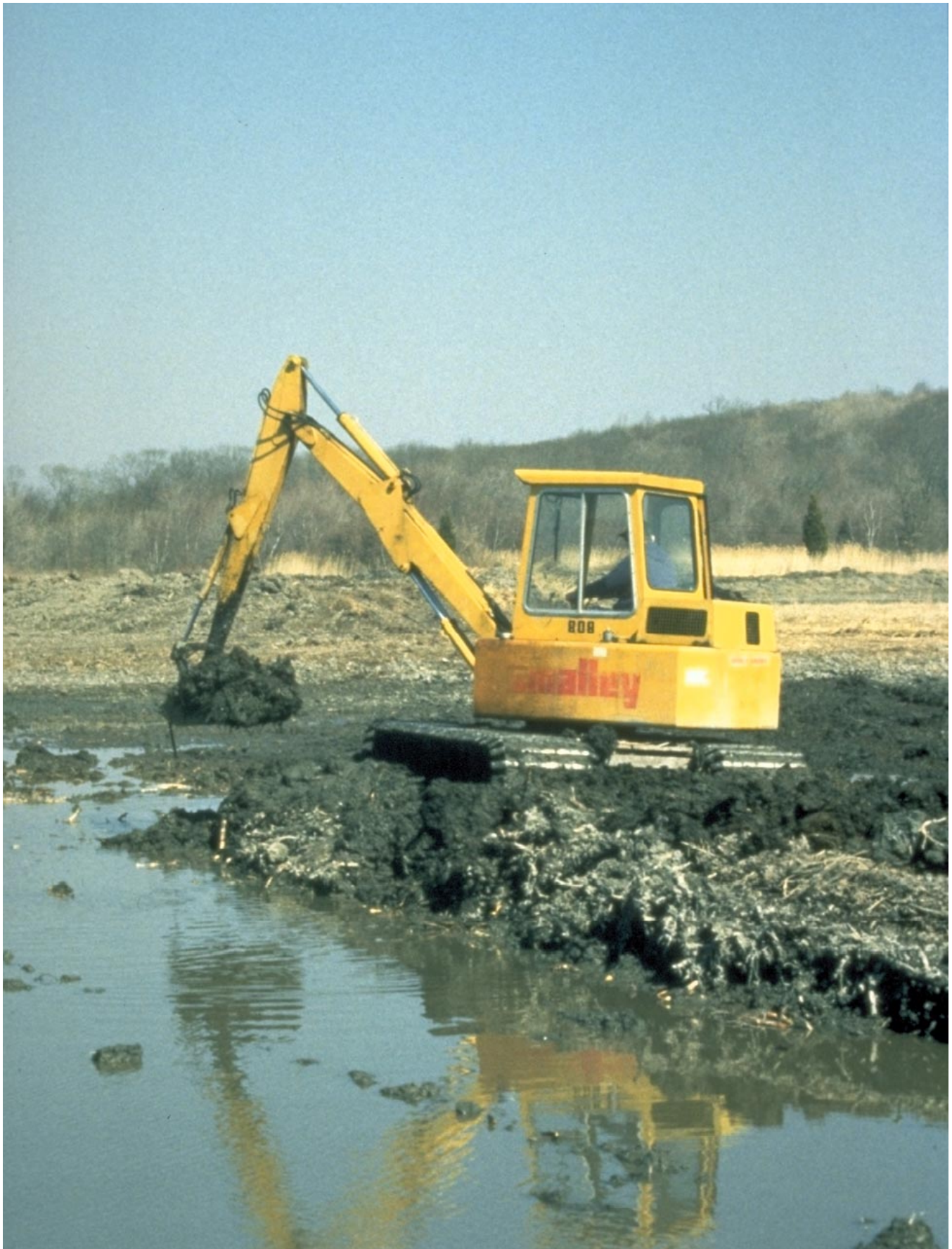
Coastal marsh restoration is just one type of recovery activity implemented to restore habitat to benefit a variety of species, like the Yuma clapper rail.