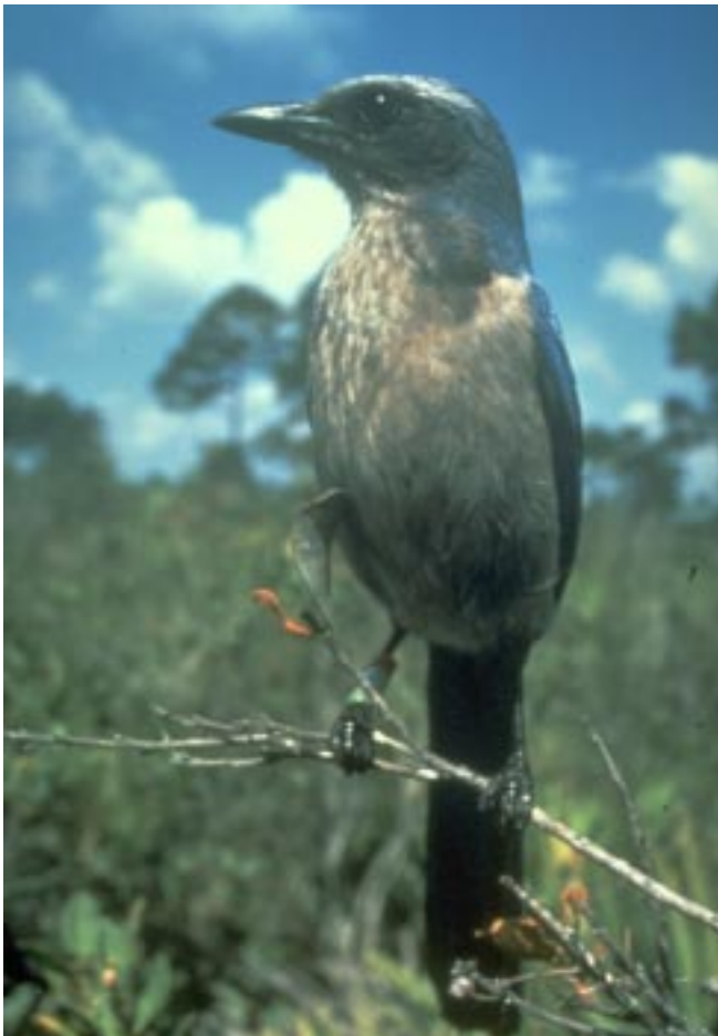
Florida scrub jay populations are being protected through the habitat conservation planning process currently being implemented in the Southeast.

A coordinated recovery effort among the Service, other Federal, State, and local agencies, conservation organizations, and individual citizens has set the stage for implementing recovery activities for the tan riffleshell mussel. A recent mollusk survey discovered two populations of this endangered mussel. The populations were healthy and rebounding and were found to be reproducing. Additional research efforts on the species' life history is essential to its recovery. The Service is reaching out to other partners, especially local agencies, individuals, and organizations to enlist their support in protecting this species by restoring the stream habitat and water quality that it requires.