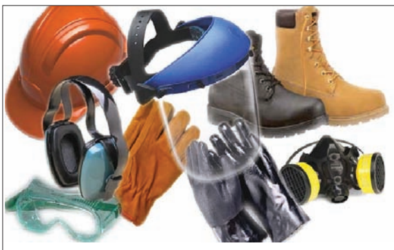
Figure 4 – Personal Protective Equipment

Where security personnel's assigned roles include closer approach to the release area or involve potential exposures, the hazard assessment and selection of PPE must account for the higher level of potential exposures.