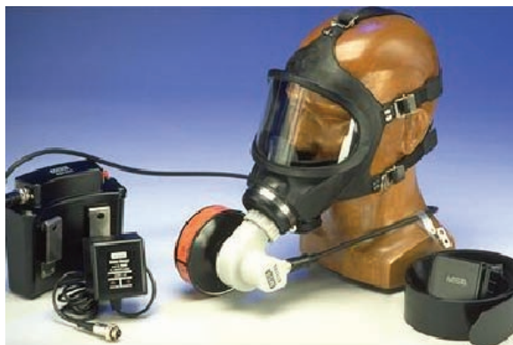
Figure 6 – Air Purifying Respirator (APR)