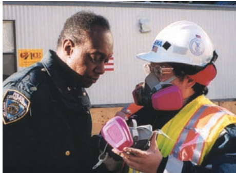
Figure 2 – PPE Training

ment operations within the capabilities of the resources and personal protective equipment available within their unit.