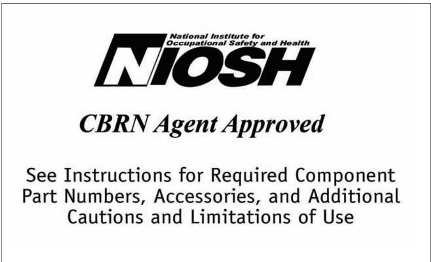
Figure 8 – NIOSH CBRN Agent Approval Label