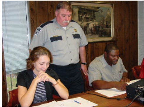
Figure 3 – Annual Training

competencies for their expected duties. Refresher training may be given in segments throughout the year so long as the required refresher training has been completed by the employee's training anniversary date. Time spent by security personnel critiquing or reviewing incidents may also be credited toward their annual refresher training requirements.