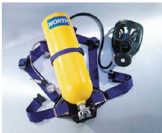
Figure 7 – SCBA Gear

For security personnel who will respond to emergency incidents involving potential exposure to CBRN agents, the employer must select and provide respirators that are CBRN agent approved by NIOSH. Currently, NIOSH has only certified a number of SCBA, APR, and air-purifying escape respirator (APER) units.