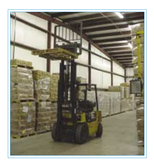
Occupational Safety and Health Administration