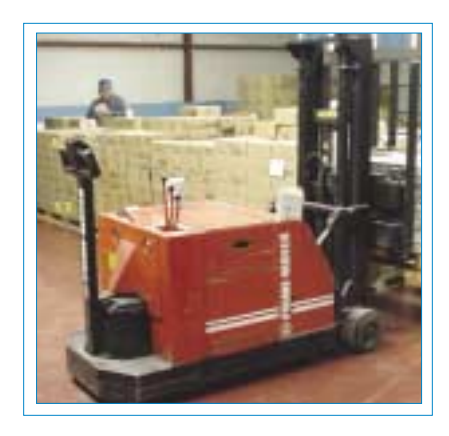
Occupational Safety and Health Administration

The company adopted 13 of the 19 feasible controls that OSHA recommended. And the result, thus far, speaks for itself: a perfect zero for back injuries, improved productivity and higher employee morale.