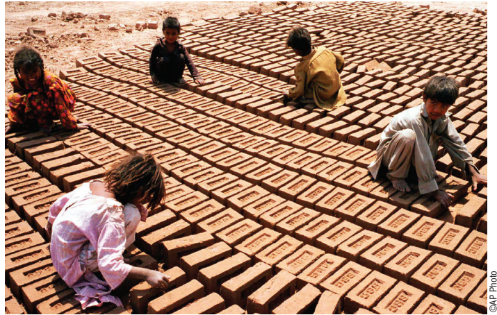
Abused children in South Asia

of serious and significant actions to combat trafficking occurring at home. A few examples of American efforts include: