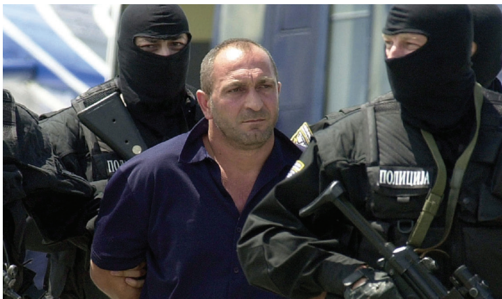
Convicted Macedonian trafficker

Trafficking impacts many nations, including the United States. That's why the U.S. Government has taken a number