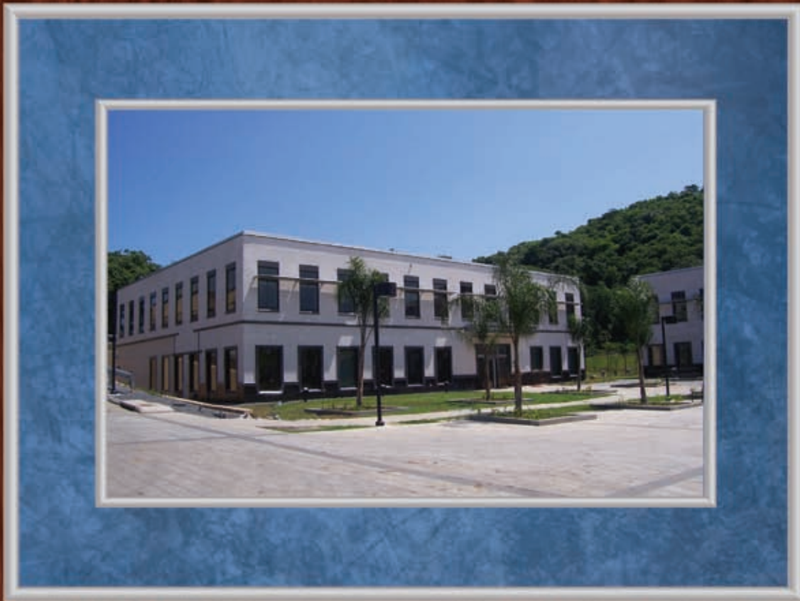
MANAGUA, NICARAGUA NEW USAID ANNEX