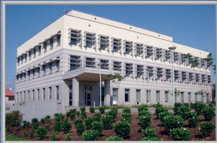
ACCRA, GHANA NEW USAID ANNEX