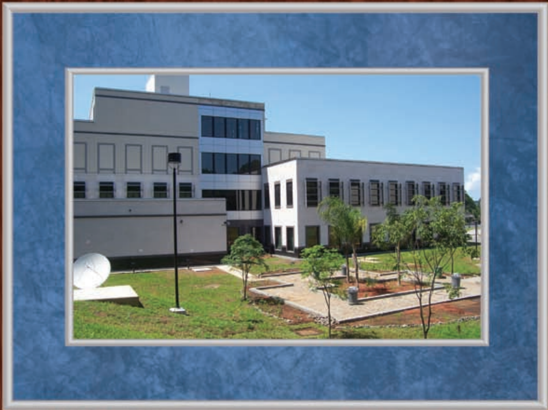
MANAGUA, NICARAGUA NEW EMBASSY COMPOUND