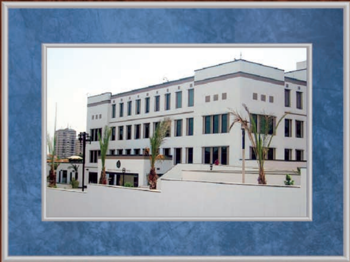
ALGIERS, ALGERIA NEW EMBASSY COMPOUND