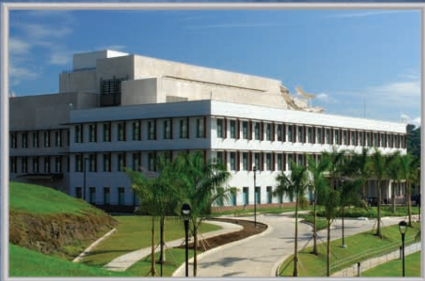
PANAMA CITY, PANAMA NEW EMBASSY COMPOUND