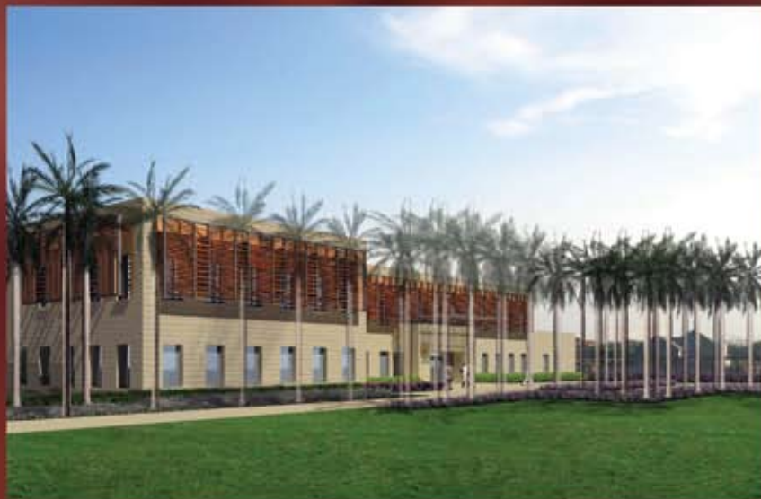
SURABAYA, INDONESIA NEW EMBASSY COMPOUND