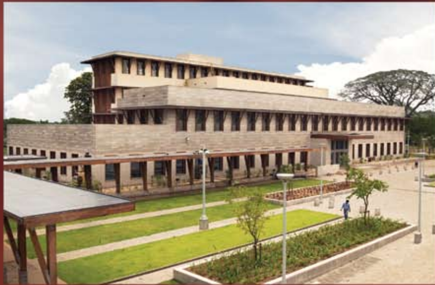
RANGOON, BURMA NEW EMBASSY COMPOUND