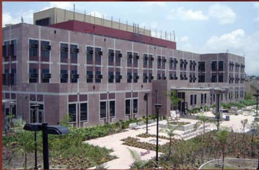
KATHMANDU, NEPAL NEW EMBASSY COMPOUND