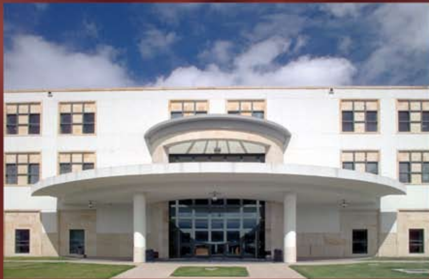
BOGOTÁ, COLOMBIA NEW OFFICE ANNEX