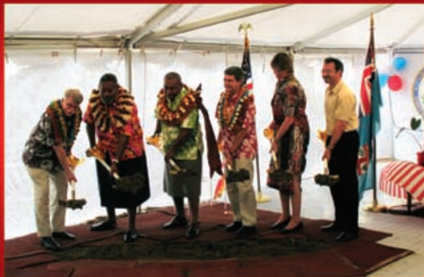
SUVA, FIJI NEW EMBASSY COMPOUND