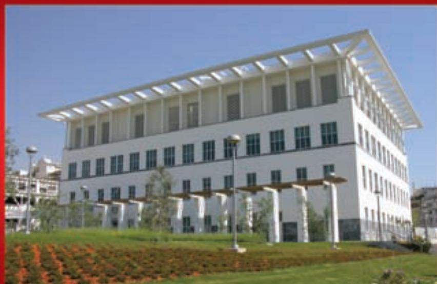
ATHENS, GREECE NEW OFFICE ANNEX