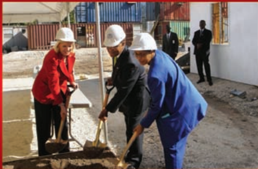
KINGSTON, JAMAICA NEW USAID ANNEX