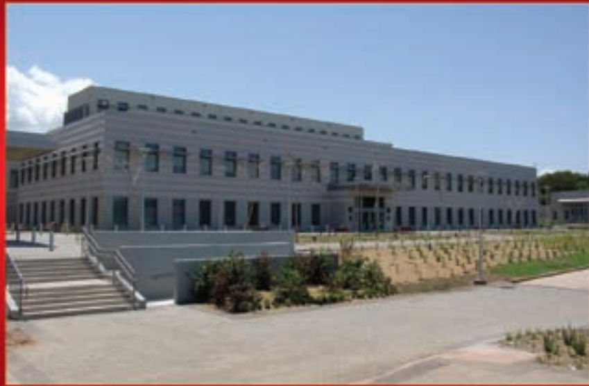
ACCRA, GHANA NEW EMBASSY COMPOUND