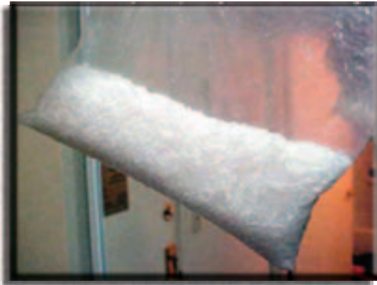
Omaha (NE) Police Department