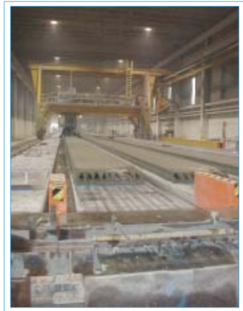
Oldcastle Precast's Manchester New York Division.

Additional information about OSHA's Voluntary Protection Programs is available on the agency's website at www.osha.gov , from regional OSHA VPP managers or local OSHA offices. The Voluntary Protection Programs Participants' Association ( www.vpppa.org ) administers a mentoring program for those worksites considering participation.