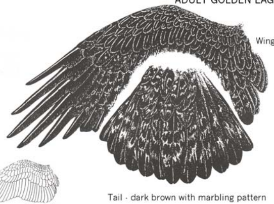
ADULT GOLDEN EAGLE