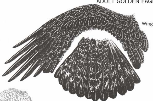
Tail - dark brown with marbling pattern