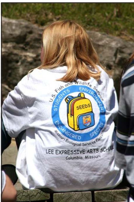
A student wears her SEEDS t-shirt, donated by the Columbia ES Field Office.