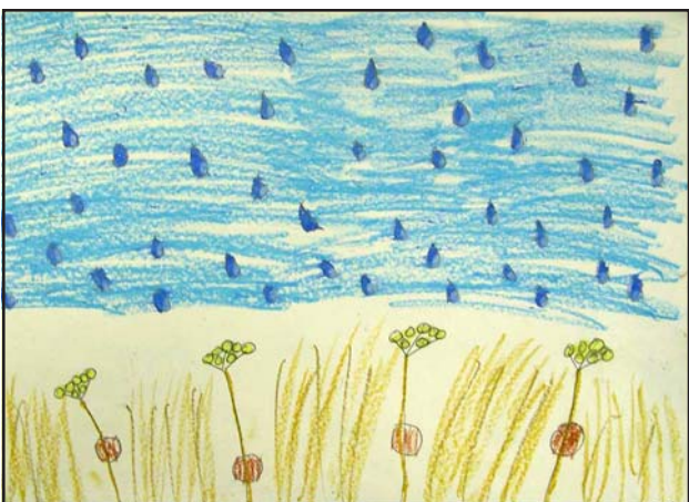
Artwork from the 2006-2007 River of Words project.