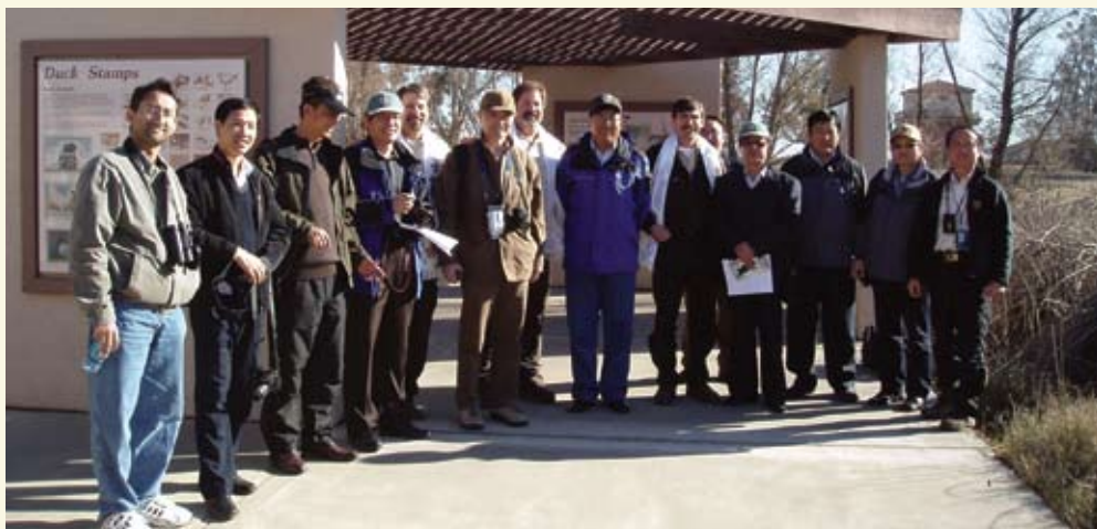
Chinese wildlife officials visit Sacramento and San Francisco Bay National Wildlife Refuge Complexes in California in January.

“Both California refuges are large complexes dealing with multiple areas and issues affected by encroaching development, very similar to the reserves in China” explains Takekawa. The Chinese representatives were particularly interested in restoration work, resource monitoring and interpretive displays. “They were very impressed by the interpretive displays because they lack the experience to make life-like displays in China,” said Takekawa.