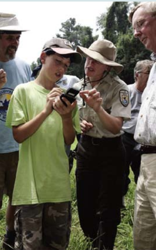
Throughout the Refuge System, invasive plants are a pervasive, hard-to-fight problem. Children are some of the best weapons because they just love to rip out weeds – and to use electronic gadgets to locate invasives.

Before the first hook hit the water in the catch-and-release competition, though, the children visited several different informational stations. At the most extensively equipped stop, they heard about the dangers of drugs from Galloway police officers aided by Explorer Scouts. In addition to straight talk and brochures, the effects of drugs were brought home by exhibits such as a pickled liver, preserved to show the life-ending damage that addiction can bring.