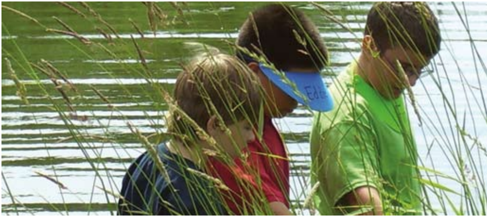
During the camp, sponsored by the Friends of Mid-Columbia River Wildlife Refuges and a local private school, students learn about wetland, riparian and shrub-steppe habitats.

The cultural legacies that people left behind – their footprints on the landscape – give fascinating insights into our past. The connection between our historic roots and our natural resource roots is unbreakable. So, even as we battle some cultural resource looting – as told in a story on page 5 of this Refuge Update – we remember that in protecting the land, we conserve the tales and dreams of our ancestors. What fine stories we have to tell. ♦