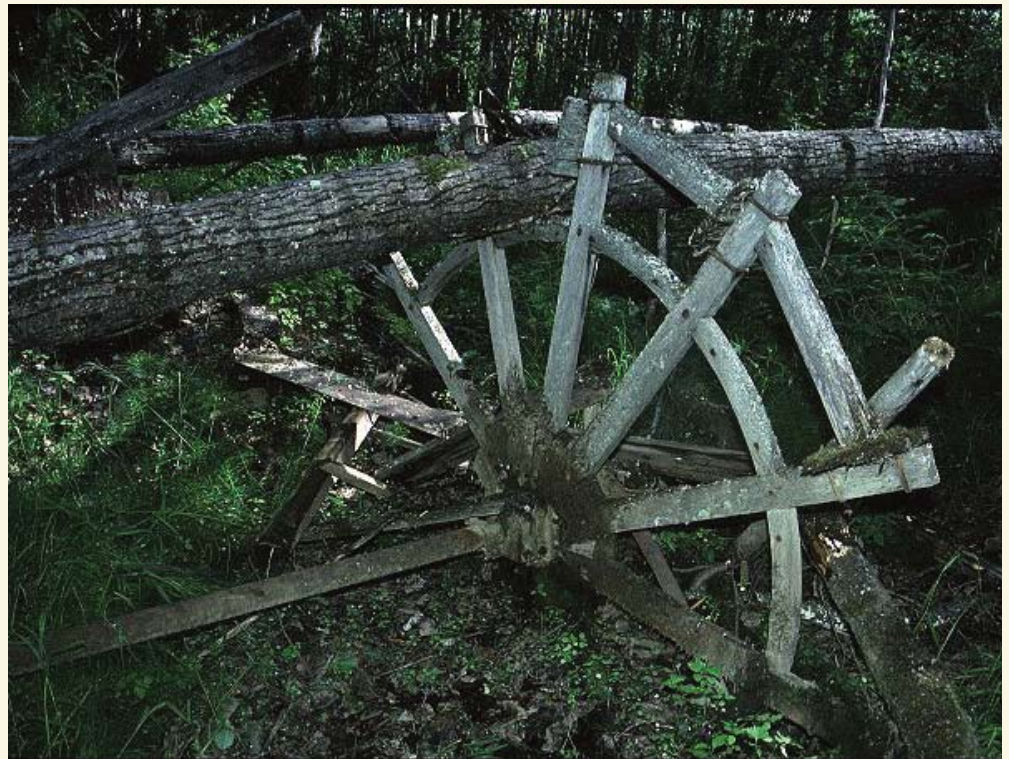
During Alaska's Iditarod National Historic Trail Centennial, Innoko National Wildlife Refuge will spotlight the rich history of the trail and many remnants of the Gold Rush days, among them this fragment of an abandoned steamboat.