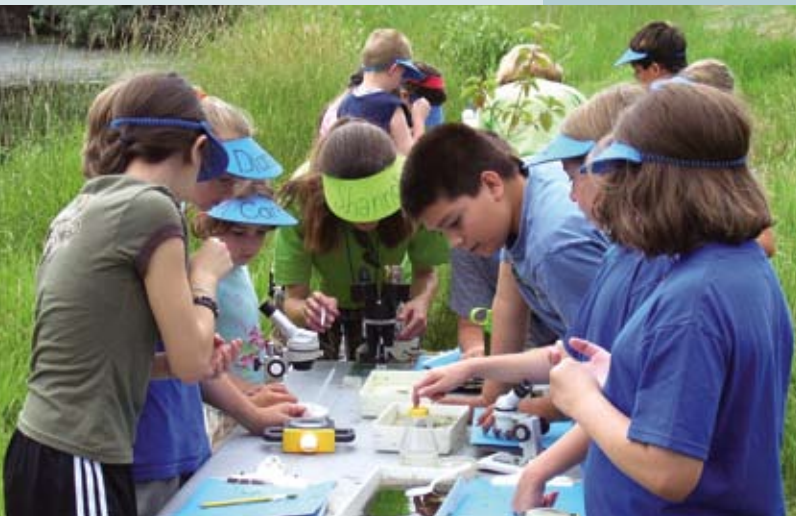
The week-long Urban Wildlands Ecology Camp, a partnership between the Friends of Mid-Columbia River Wildlife Refuges and the private Oasis School, lets children engage in interdisciplinary learning that helps them appreciate ecological relationships.

One set of booklets and handouts is geared for kindergarten through third grade, another set for fourth through eighth grades. First, a general walk through the mile-long route takes the edge off the kids' energy. Then, after a snack at the trailhead, smaller groups rotate among several stations along the trail to study plants, animals and other aspects of nature. Microscopes, nature artifacts and hands-on activities hold the youngsters' interest, and trained instructors guide the students at each station.