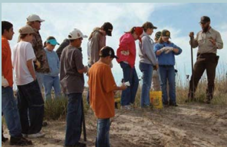
Students from Walnut Middle School transplanted 2,100 penstemon plants in the sandy blowouts of Valentine National Wildlife Refuge in Nebraska.