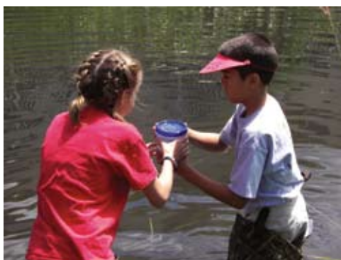
The McMurray Park Waterway in Richland, WA is a wonderland for kids in the week-long Urban Wildlands Ecology Camp.

Campers learn about wetland, riparian and shrub-steppe habitats of the park that for some children is in their own backyard. In addition, campers learn creative ways to express their experiences in nature. Visual arts, writing, drama, dance and music afford/allow/give the children different ways of articulating and understanding their