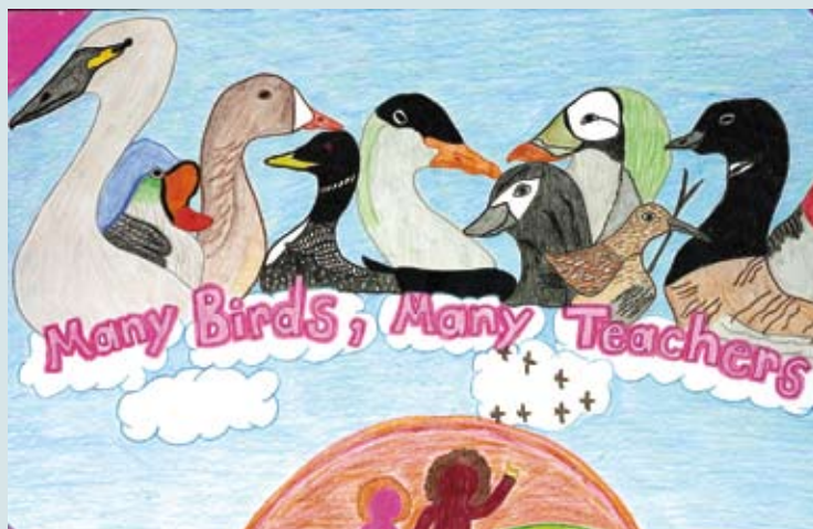
An annual Migratory Bird Calendar competition that involves 11 Alaska's field stations is teaching rural Alaskan children important lessons about bird conservation.