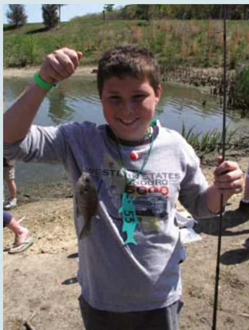
At the annual fishing derby New Jersey's Edwin B. Forsythe National Wildlife Refuge and the Township of Galloway hold every spring, kids get lessons for life on the perils of drugs and (if they're lucky) their hooks into a fish or two.

The annual derby is affiliated with the "Hooked On Fishing – Not On Drugs" program of the American Sportfishing Association's Future Fisherman Foundation.