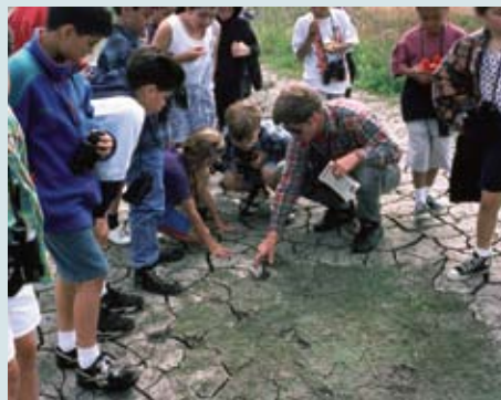
We are instilling in American's kids our own passion for wild places and wild things.

The Service wants to work more closely with parents. The Connecting People