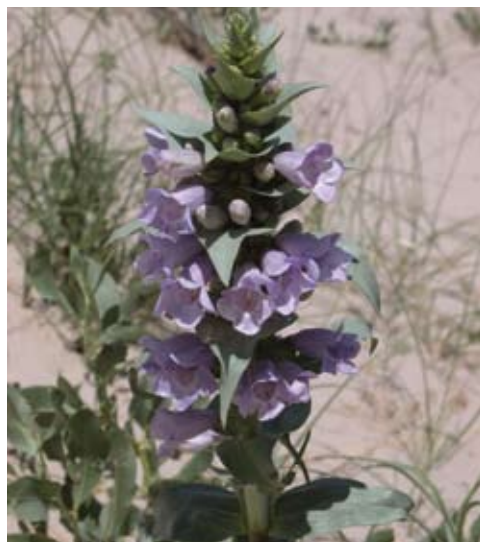
The blowout penstemon is native to the Nebraska Sandhills. Loss of habitat, an invasive moth and demanding germination conditions put the penstemon on the endangered species list in 1987. (Jim Stubbendieck)

“I had many first time experiences such as fishing in a boat, canoeing, s'mores and sleeping in a tent. It was