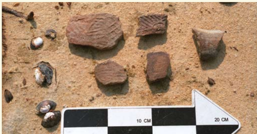
Ancient archeological sites at Santee National Wildlife Refuge in South Carolina are being illegally plundered by avid collectors of rare – and valuable – artifacts and by others out to make a profit. Looting is a problem all across the Refuge System.