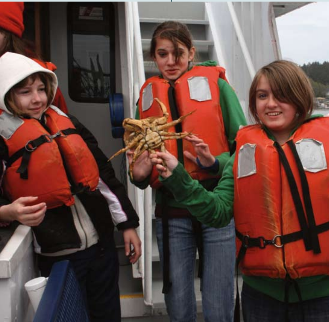
The Girl Scouts are pictured at the mudflats of Yauquina Bay in Portland, OR. On the Oregon Coastal Refuge Complex, the Scouts were taught how to use binoculars and collect data during the spring migration of shorebirds.

The girls were selected from among 40 who responded to a survey sent to about 1,000 Girl Scouts in fall 2007. Part of the Girl Scout program is to help the girls learn how to make their own decisions and create their own destinies. So, I laid out a map of the Refuge System and