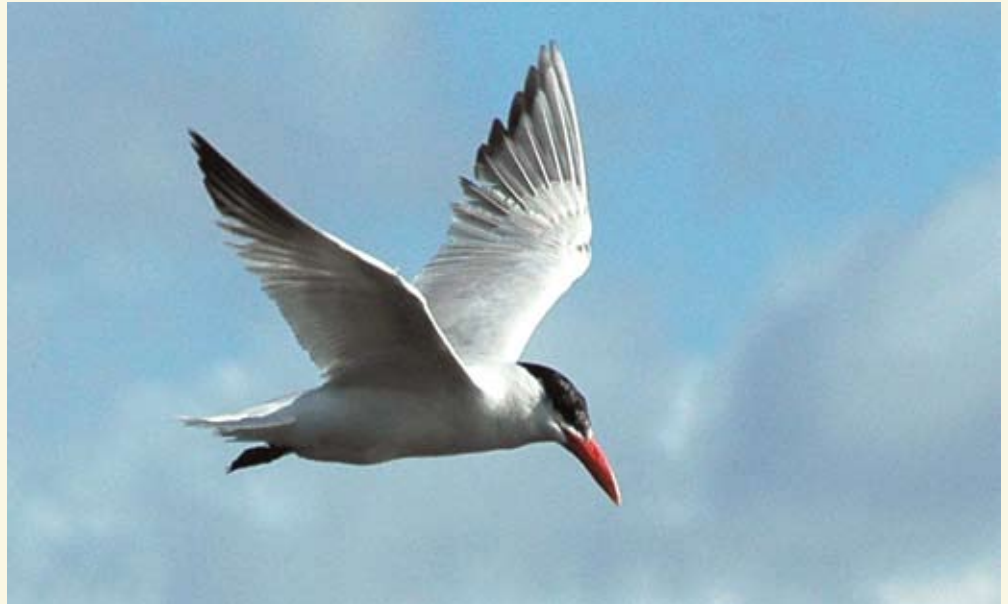
Two of only a handful of active Caspian tern colonies in Lake Michigan in 2007 were located on islands managed by Seney and Horicon National Wildlife Refuges.

The survey was initiated to provide baseline data on colonial waterbirds, which collectively are very abundant in the Great Lakes. These waterbirds are also very sensitive to environmental change.