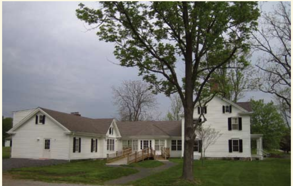
The visitor center at Great Swamp National Wildlife Refuge in New Jersey will be named for the late Helen Fenske, a tenacious conservationist.

Sheldon's Horse and Burro Management Program seeks to maintain relatively stable numbers at the 2007 population levels of approximately 800 horses and 90 burros until the CCP is completed around 2010. This will be accomplished by periodic roundups and an adoption program that would move horses and burros off refuge lands in a humane manner.