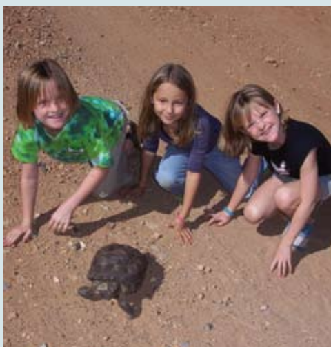
Buenos Aires National Wildlife Refuge in Arizona has launched an innovative get-close-to-nature program to introduce children to the desert's natural wonders.

Created through a partnership between the Friends of Mid-Columbia River Wildlife Refuges and Oasis School, a local private school, the camp has served the community since June 2006. Sometimes as many as half of the 40 campers are from the subsidized housing or low income areas around the park. The children engage in interdisciplinary learning that helps them understand and appreciate plants,