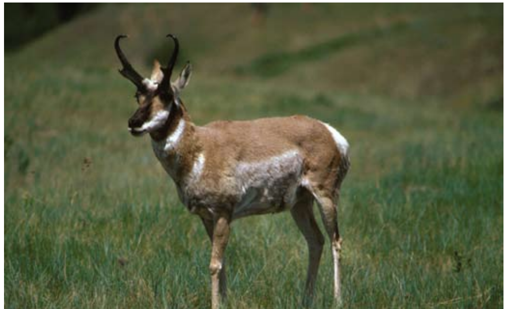
In Wyoming, National Elk Refuge and other federal land managers in the Greater Yellowstone ecosystem are part of an effort to preserve migration paths that a pronghorn herd has used for thousands of years.