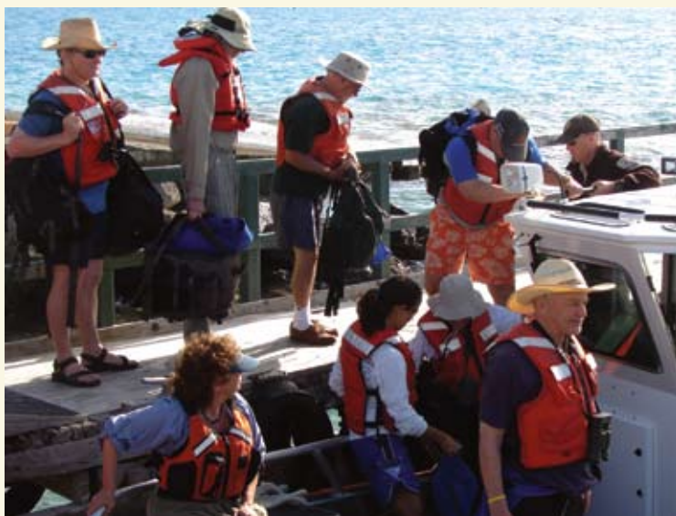
For the first time in six years, Midway Atoll National Wildlife Refuge – site of an epic naval battle in 1942 – has reopened its doors to tour groups. (Wayne Sentman)

The Oceanic Society – a nonprofit marine conservation organization based in San Francisco – has been authorized to coordinate seven week-long tours in 2007 and another round of island visits in 2008. The tour season runs through December, with an August to October break while the albatross are at sea. For now, each tour is limited to no more than 16 participants.