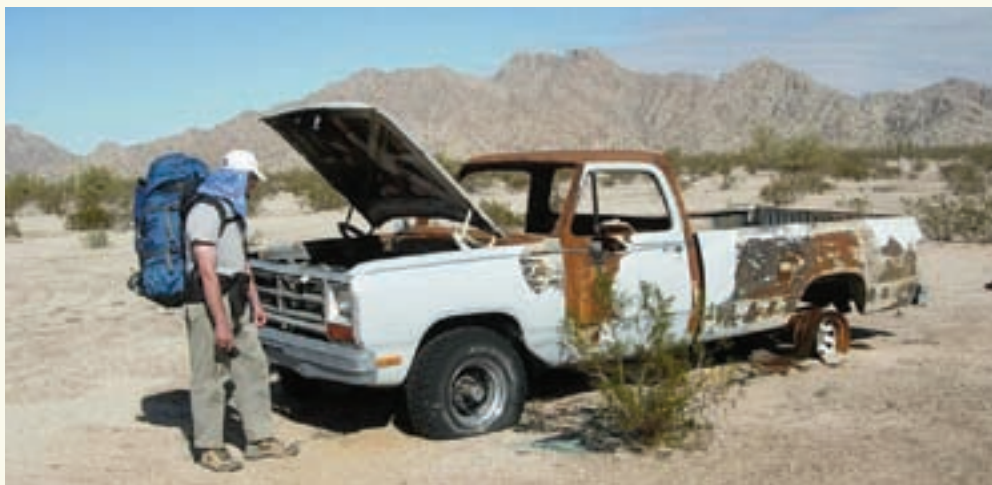
The deputy project leader at Cabeza Prieta National Wildlife Refuge, joined by a headquarters staff member from Arlington, VA hiked 72 miles across the sprawling Arizona refuge to monitor the impact of illegal immigration and Border Patrol actions on delicate desert ecosystems.