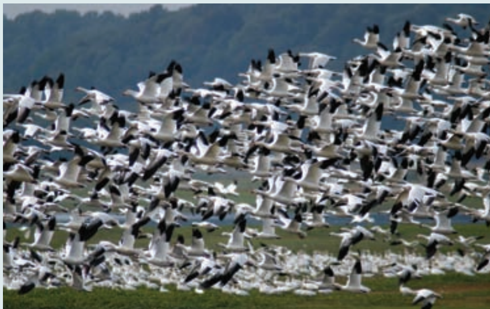
A birding trail brochure describes Bombay Hook as Delaware's "single best-known birding site" and calls its fame justified.

Nearly 48 million Americans enjoy watching birds, according to the 2006 National Survey of Fishing, Hunting, and Wildlife-Associated Recreation . "Bird watching has never been more popular. With so many people across the country enjoying the wonders of birds, we are committed to providing them