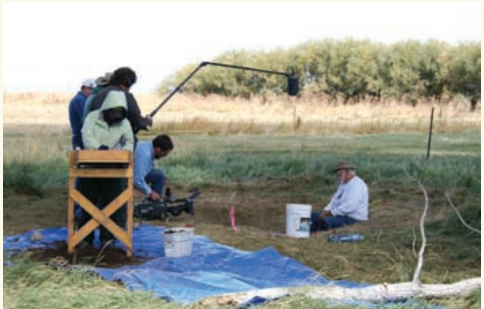
For a new film that spotlights the looting of valuable archaeological sites, a crew from the Federal Law Enforcement Training Center in Georgia shot several scenes at a number of prehistoric locations at Oregon's Malheur National Wildlife Refuge.

A film crew from the Federal Law Enforcement Training Center in Georgia shot scenes at Malheur Refuge, among other locations, for a new film that spotlights the looting of archaeological sites. The film will be used to acquaint new law enforcement officers with the wide variety of archaeological and historic sites that are looted for profit. The film focuses on violations of the federal Archaeological Resource Protection Act of 1979 that prohibits the destruction of historic and prehistoric sites. Parts of new version were shot at a number of Malheur Refuge's prehistoric sites, including archaeological excavations underway at the Sod House Ranch. The film is expected to be completed in the spring.