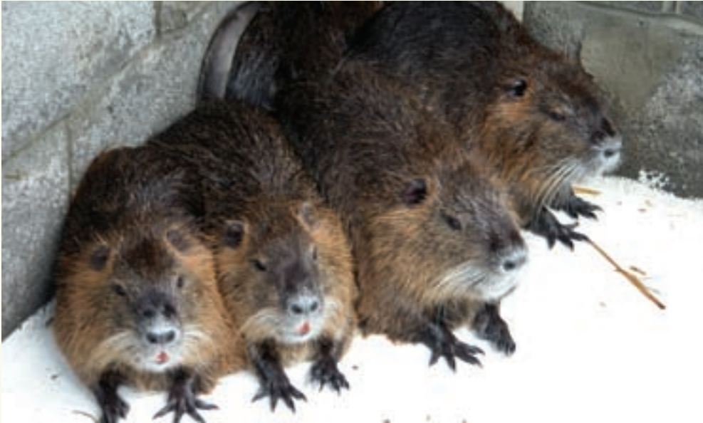
Invasive nutria were eradicated from Blackwater National Wildlife Refuge in Maryland in 2004, but control efforts continue along the Chesapeake and Delaware Bays.