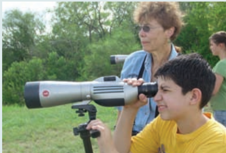
Aransas National Wildlife Refuge became the first refuge partner of a Council on Environmental Education program called Flying WILD.

Pre- and post-tests show the youngsters learn a lot. “Eighty percent of the kids