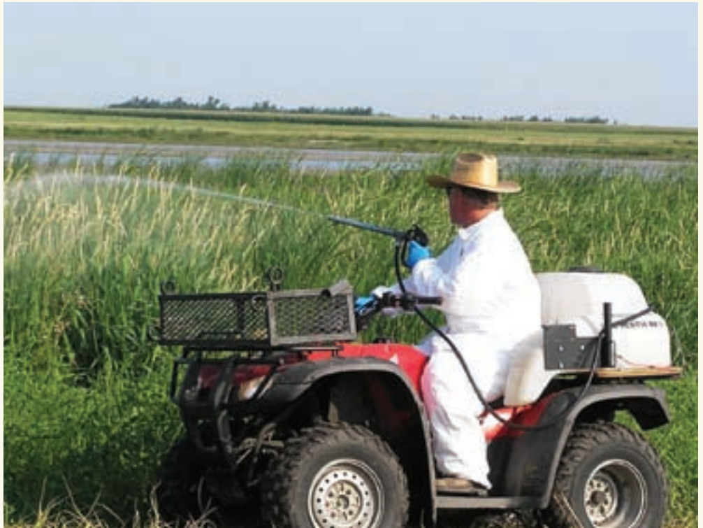
All-terrain vehicles enable crews to comb Waterfowl Production Areas for even small patches of Canada thistle.

After hours spent squinting into the bright Nebraska sun, crews load ATVs back onto trailers for the return home – sometimes a two-hour journey. Once back, ATVs are washed to prevent the spread of undesired seed and refueled. Water tanks are filled and repairs are done so the process can start again the next morning – at 6 a.m.