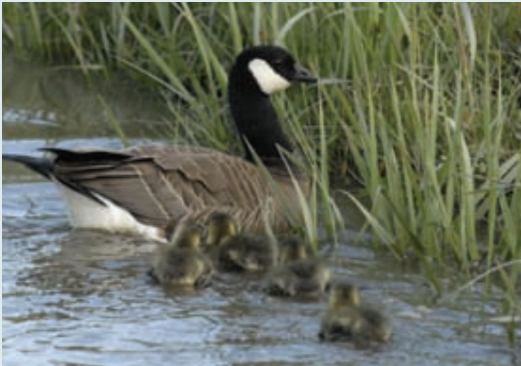
Birders flock to Oregon's Tualatin River National Wildlife Refuge, 15 miles from downtown Portland. Some 400 acres of the refuge opened to the public in June 2006. (Jim Williams)

routinely share their observations and species checklists from refuge visits. Even local and regional newspapers and television stations have highlighted Tualatin River Refuge as a wildlife watching opportunity for expert birders