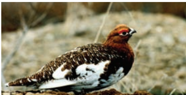
Kenai Refuge initiated its Birding Hotline in 2004 as one way to solicit interesting or rare bird sightings.

Although not native to Alaska, European starling is already on the state checklist, not merely because it is believed to have made it to Alaska on its own, where it typically lives in urban and agricultural environments, but because it also persists, though not commonly, in the larger wilder landscape. European starling along with the newly arrived Eurasian collared dove and the rarely encountered house sparrow and house finch have the dubious distinction of being our only invasive bird species encountered in Alaska.