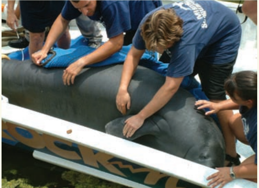
Manatees are gentle marine mammals that all too often lumber into harm's way. Whenever they do, the Crystal River National Wildlife Refuge's 12-member manatee rescue team often gets a call.