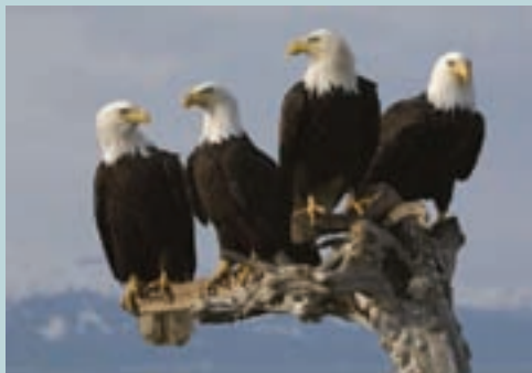
A generation ago, not many people came to the Kenai Peninsula of Alaska – or to Kenai National Wildlife Refuge – expressly for birding. These days, a record-setting number of bird species has made the state a birding hot spot.

Is that attitude shift long lasting? Grafe isn’t sure. “Birders are still usually older than 50, but young families are coming to birding festivals and birding on the coast has taken off.” ♦