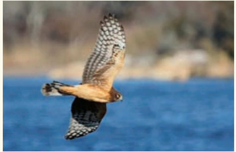
Birders have a chance to see some of the thousands of tundra swans—and numerous species of raptors — on Lower Klamath National Wildlife Refuge during the Winter Wings Festival held on President's Day weekend each year. This year, they also have the chance to celebrate the refuge's centennial.

On April 19, visitor tours centered on historical events on the refuge