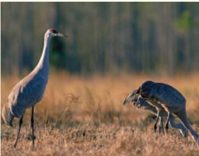
For the first time in 100 years, the population of whooping cranes exceeds 500 birds. An estimated 266 – members of the only remaining national wild flock – spent the cold-weather months along a 35-mile-long stretch of Texas Gulf Coast that includes Aransas National Wildlife Refuge Complex. That’s 39 more cranes than were counted in the previous survey. (USFWS)

The higher numbers reflect an especially productive nesting season last summer 2,400 miles away at Canada’s Wood Buffalo National Park. There, a record 65 nesting pairs fledged 40 chicks; 39 of the chicks made it safely to Texas. One whooping crane pair touched down in Texas with two chicks; the cranes normally hatch two chicks every