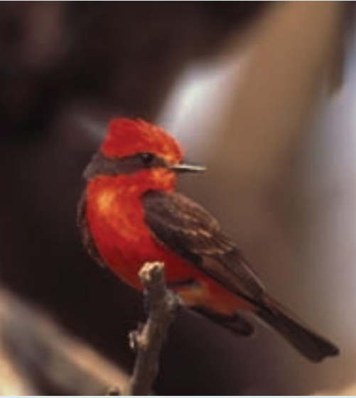
A vermilion flycatcher provided a teachable moment when youngsters visited Aransas National Wildlife Refuge in Texas.

A class of first graders had just learned to use binoculars. They stood outside Aransas National Wildlife Refuge in Texas ready to try their new skills when a vermilion flycatcher – apparently sensing the perfect teachable moment – caught an insect and landed in a nearby bush.