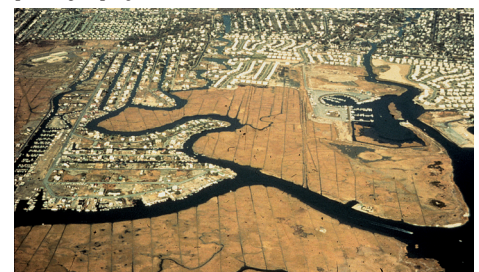
Above: Up-to-date wetland maps help solve quality of life issues.