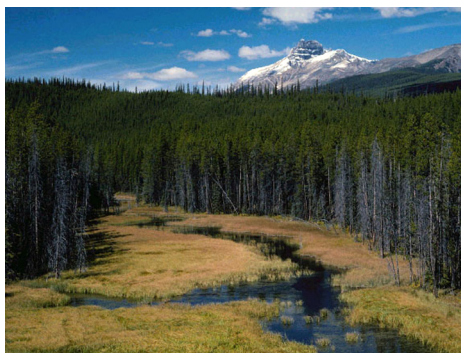
Above: Wetlands occur across the landscape.