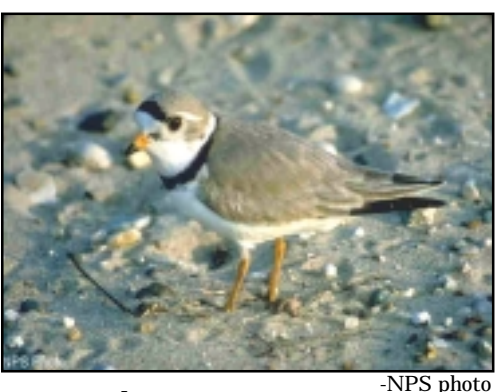
Piping plover. York July 27.

The hearings were held in Ashland, Wisc., July 17; Green Bay, Wisc., July 18; Newberry, Mich., July 19; Traverse City, Mich., July 20; Indiana Dunes, Ind., July 24; Cleveland, Ohio July 25; and Watertown, New