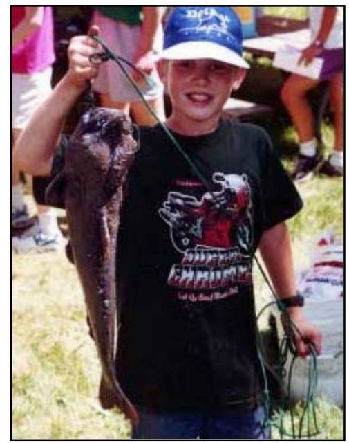
A Real Keeper: A young fisherman proudly displays one of the day's biggest catches.

Fair goers learned some basic fishing skills such as knot tying, casting, fish cleaning, and fish identification. Other interactive booths included a virtual fishing display, the conservation police traveling display, and seminars on fishing by professional fishermen using a "Hog Trough" stocked with local fish species. Russell Engelke, R3-Mark Twain NWR- Brussels District