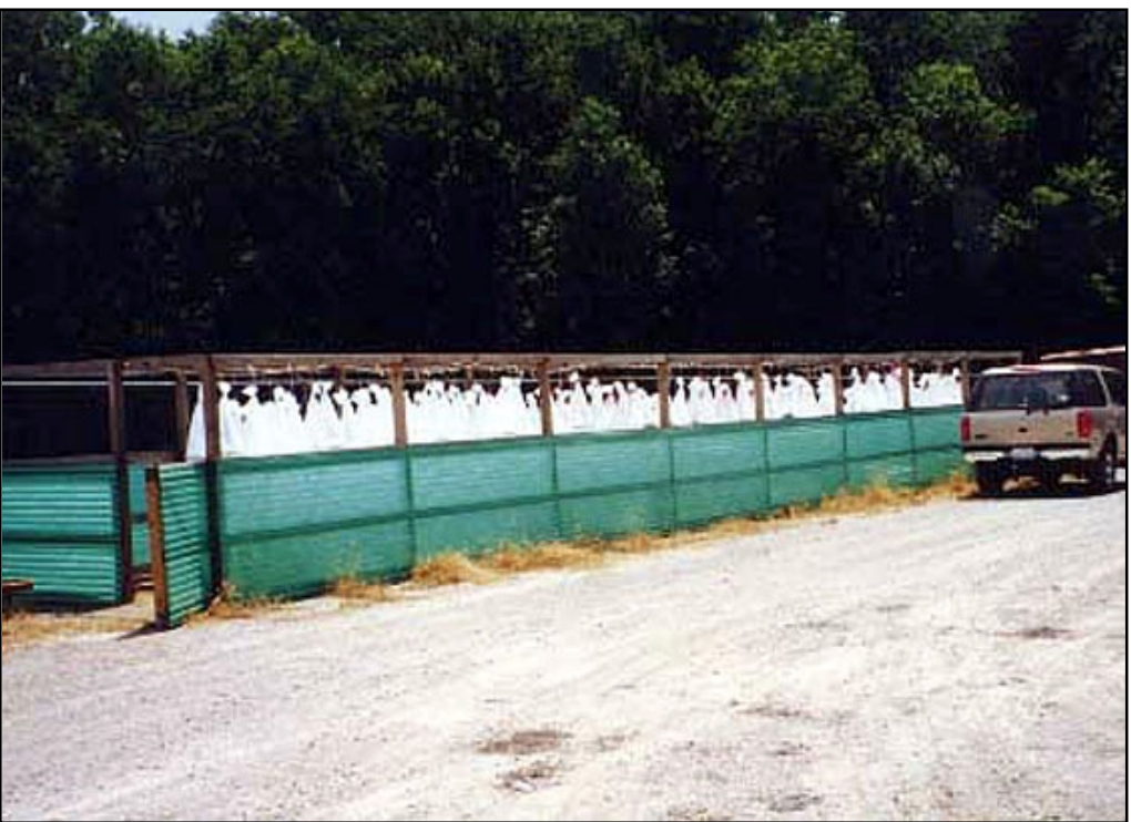
Beetle Pen. Nearly 400,000 Galerucella beetles were raised in these rearing pens at Shiawassee NWR.

An estimated 350,000 beetles have been released on the Shiawassee NWR over the last four years. These beetles were released in purple loosestrife stands on five different sites that are monitored annually. Sites which received the beetles during earlier releases are showing encouraging results this year, with greatly reduced plant numbers and reduced plant vigor. It appears to take