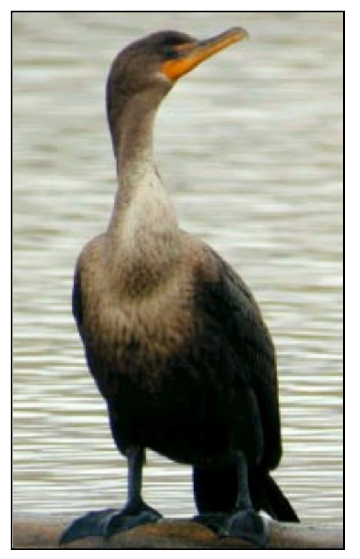
The number of Great Lakes' nest sites for the double-crested cormorant have increased by more than 29 percent annually since 1970. Approximately 93,000 pairs were recorded in 1997.

The population resurgence of double-crested cormorants has led