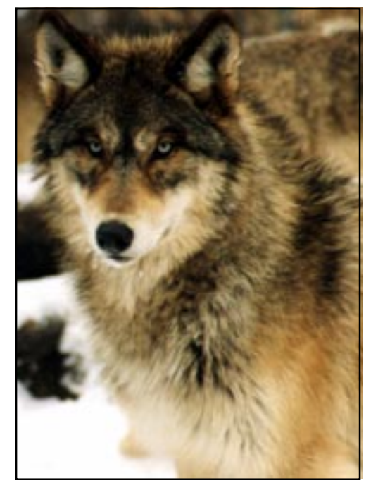
According to the National Park Service, gray wolf densities at Yoyageurs National Park range between 32-46 wolves per 1,000 square kilometers.

"While we have modified our language regarding restrictions on the bays, the main tenets of our 1992 Biological Opinion are still in place," Stinnett said. "We continue to recognize the potential for in-