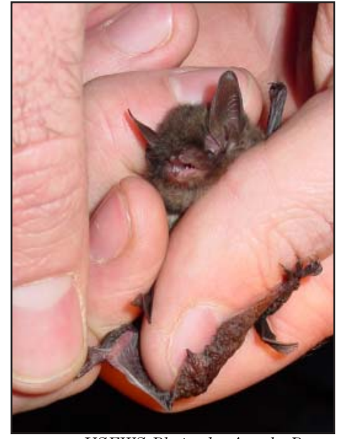
The state of Ohio, the Service and other partners are working to ensure that the endangered Indiana bat (above) and surface coal mining operations (left) can coexist.

Therefore, the agencies are working together to develop a document to aid the surface coal mining industry and the public in understanding the options and protocols associated with mining in areas