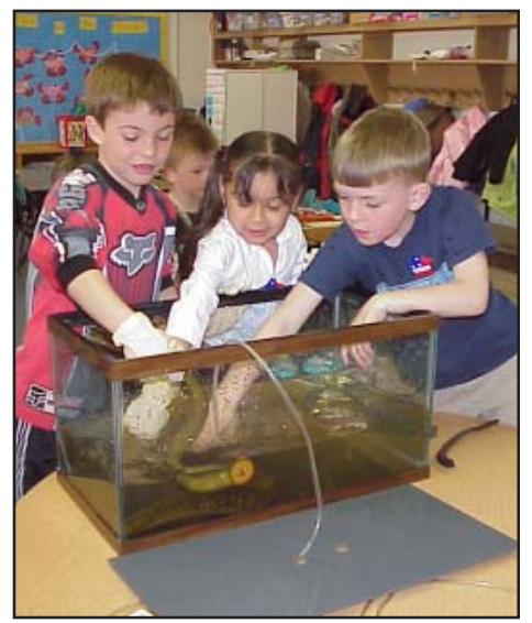
Students get some "hands-on" time with sea lampreys during Ludington's educational program.

udington Biological Station's ▲ Kevin Butterfield gave a Sea Lamprey Control presentation to a first grade class at Franklin Elementary School in Ludington, Mich. Students learned about the sea lamprey life cycle, differences between higher fish and the sea lamprey, and control and assessment methods. Nearly all 25 students handled the slippery critters following the presentation, causing lots of squeals. Other teachers stopped to see what all the commotion was and additional presentations are planned. Denny Lavis, Ludington Bio. Station